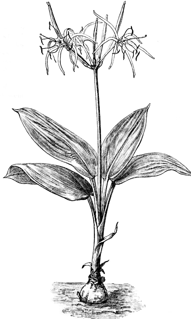
Fig. 191. — Hymenocallis cordifolia .

FIGURE 1. Holotype of Hymenocallis cordifolia . Plate 191 published in Revue Horticole (Paris) 71: 445. 1899.