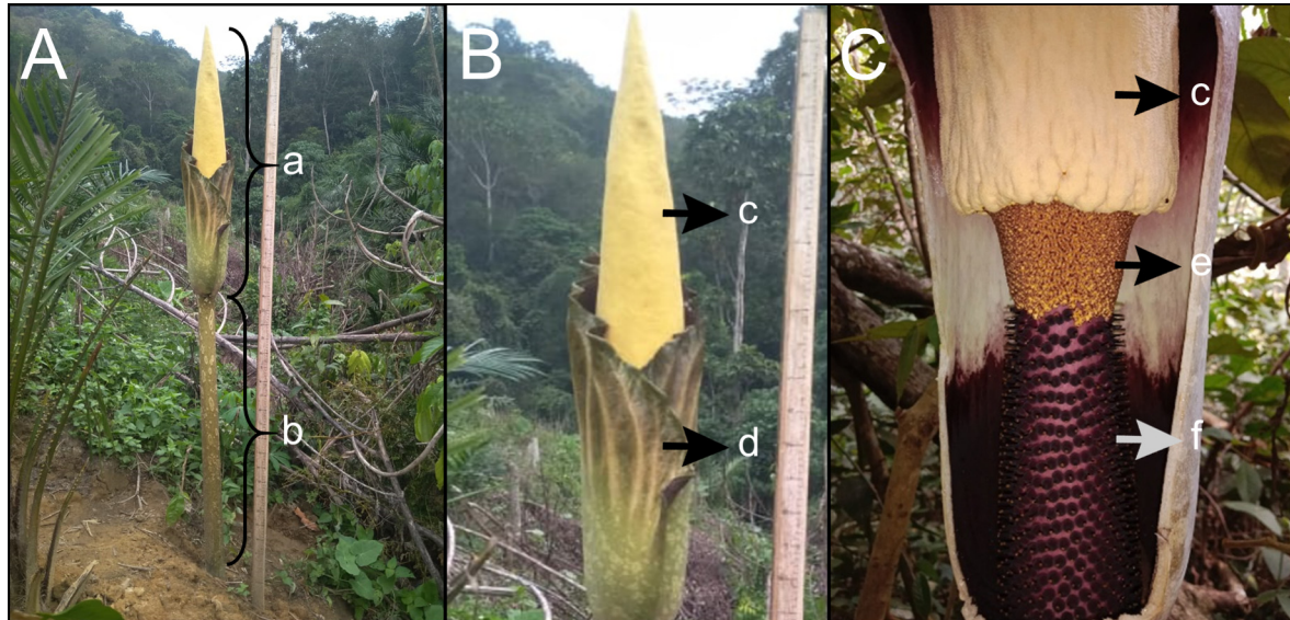
FIGURE 1. Characteristics of the inflorescence of Amorphophallus gigas : (A) general habit, showing the inflorescence (a) and peduncle (b); (B) upper part of the inflorescence, showing the appendix (c) and spathe (d); (C) longitudinal view of the opened spathe, showing the appendix (c), male flower zone (e), and female flower zone (f).

The morphology of A. gigas in North Sumatra is divided into two major groups: Group 1 (South Labuhanbatu, North Padang Lawas, and Mandailing Natal) and Group 2 (North and South Tapanuli). Detailed differences between the groups of A. gigas in North Sumatra are presented in Table 1, Figures 2 and 3, while the floral organs are shown in Figure 1. The morphological differences among A. gigas populations are presented in Table 1, which highlights the main variations in floral organs, seeds, stems, leaves, and tubers.