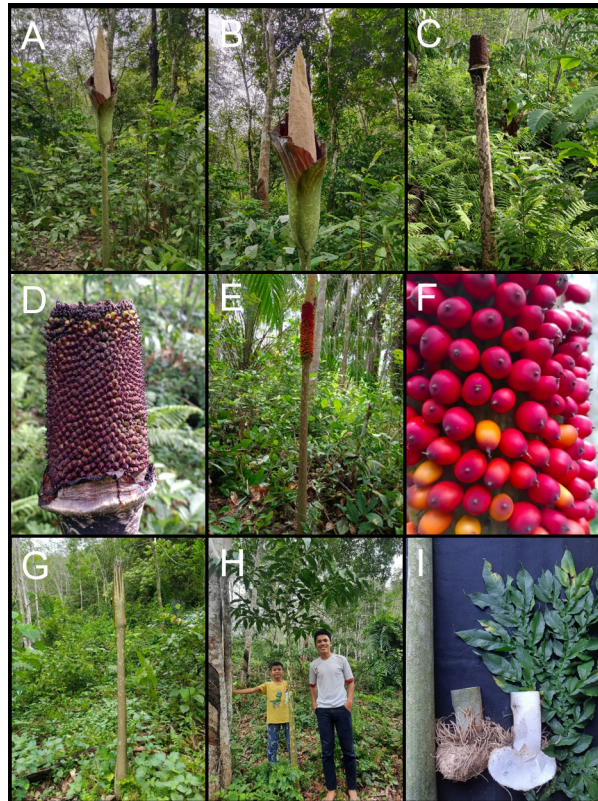
FIGURE 2. Morphological features of A. gigas variant from South Labuhanbatu, Padang Lawas Utara, and Mandailing Natal. (A) Inflorescence. (B) Close-up of the spathe and spadix. (C) Young infructescence. (D) Close-up of immature fruits. (E) Infructescence growing under the forest canopy. (F) Close-up of mature fruits. (G) Unopened inflorescence. (H) Vegetative plant with a human for size comparison. (I) Petiole, tuber, and part of the leaf blade.