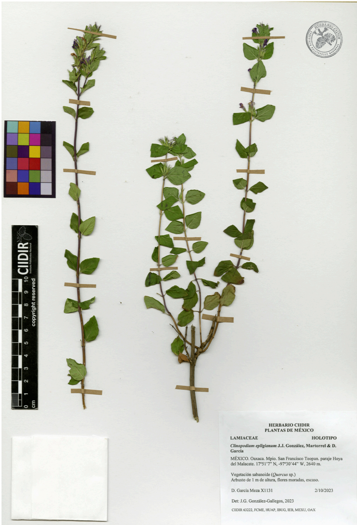
FIGURE 2. Holotype specimen of Clinopodium eplingianum .