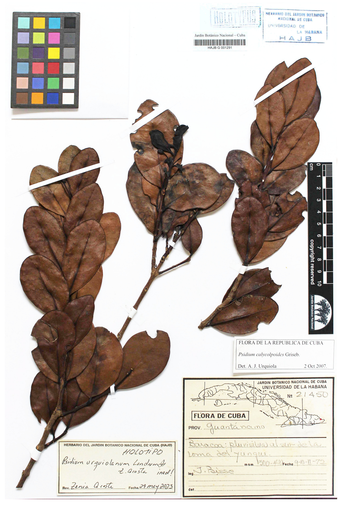
FIGURE 3. Image of holotype specimen at HAJB.