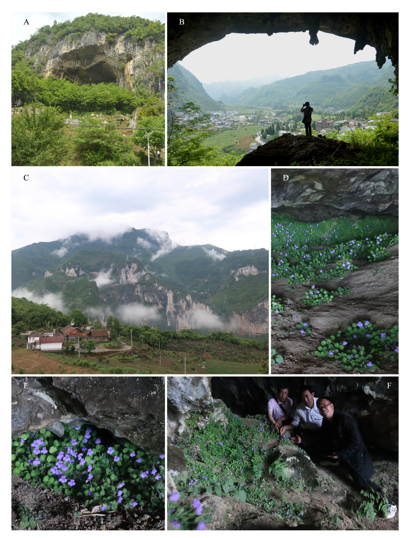
FIGURE 2. Habitats of Petrocosmea panzhouensis Sheng H. Tang & Tao Peng, sp. nov. A type locality of P. panzhouensis , growing inside the cave B , C landscape of Niangniang Mountain D , E, F P. panzhouensis in the cave at the type locality.