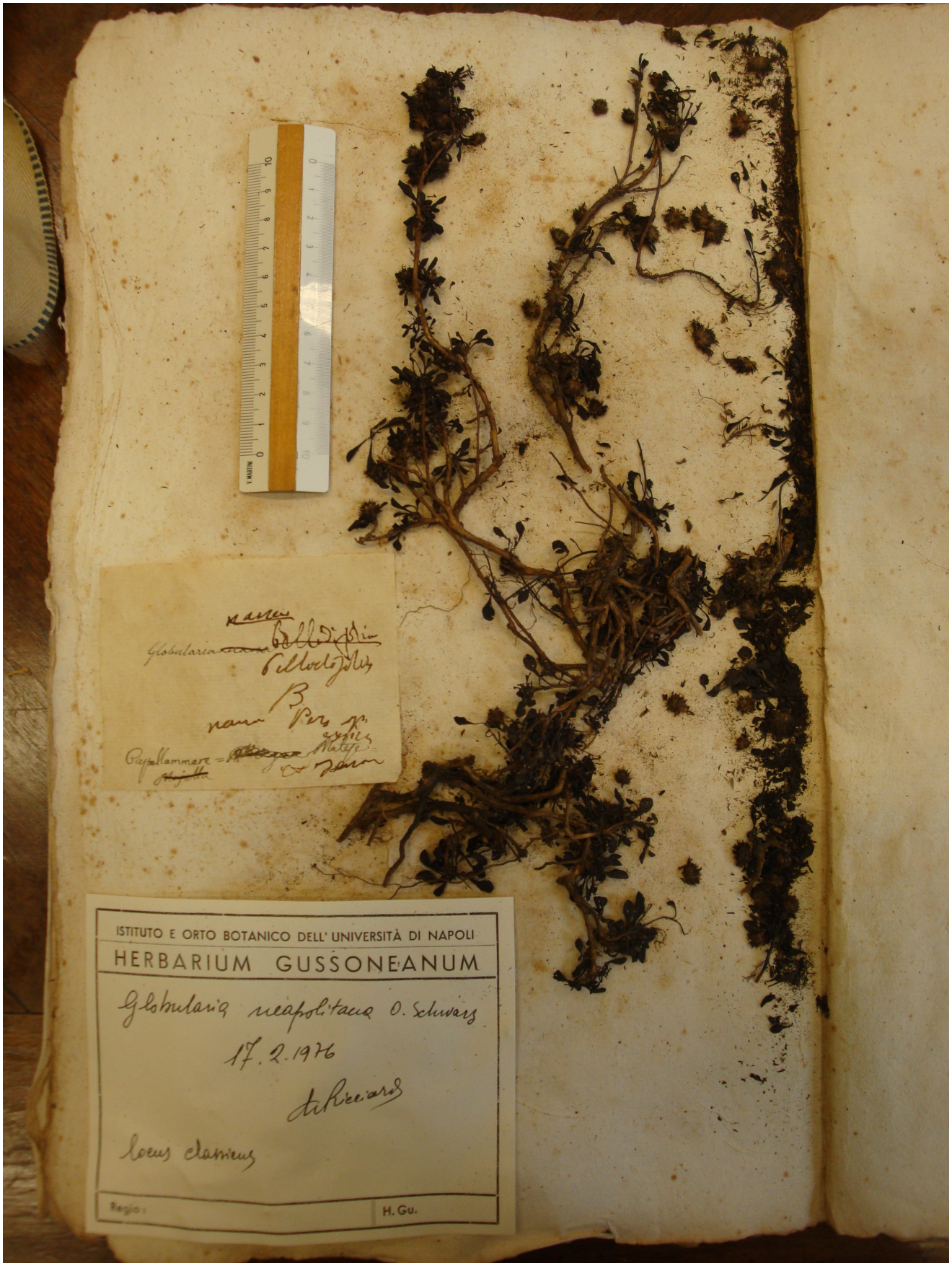
FIGURE 1. Lectotype of the name Globularia bellidifolia var. minor Ten. (NAP, by permission of the Director).