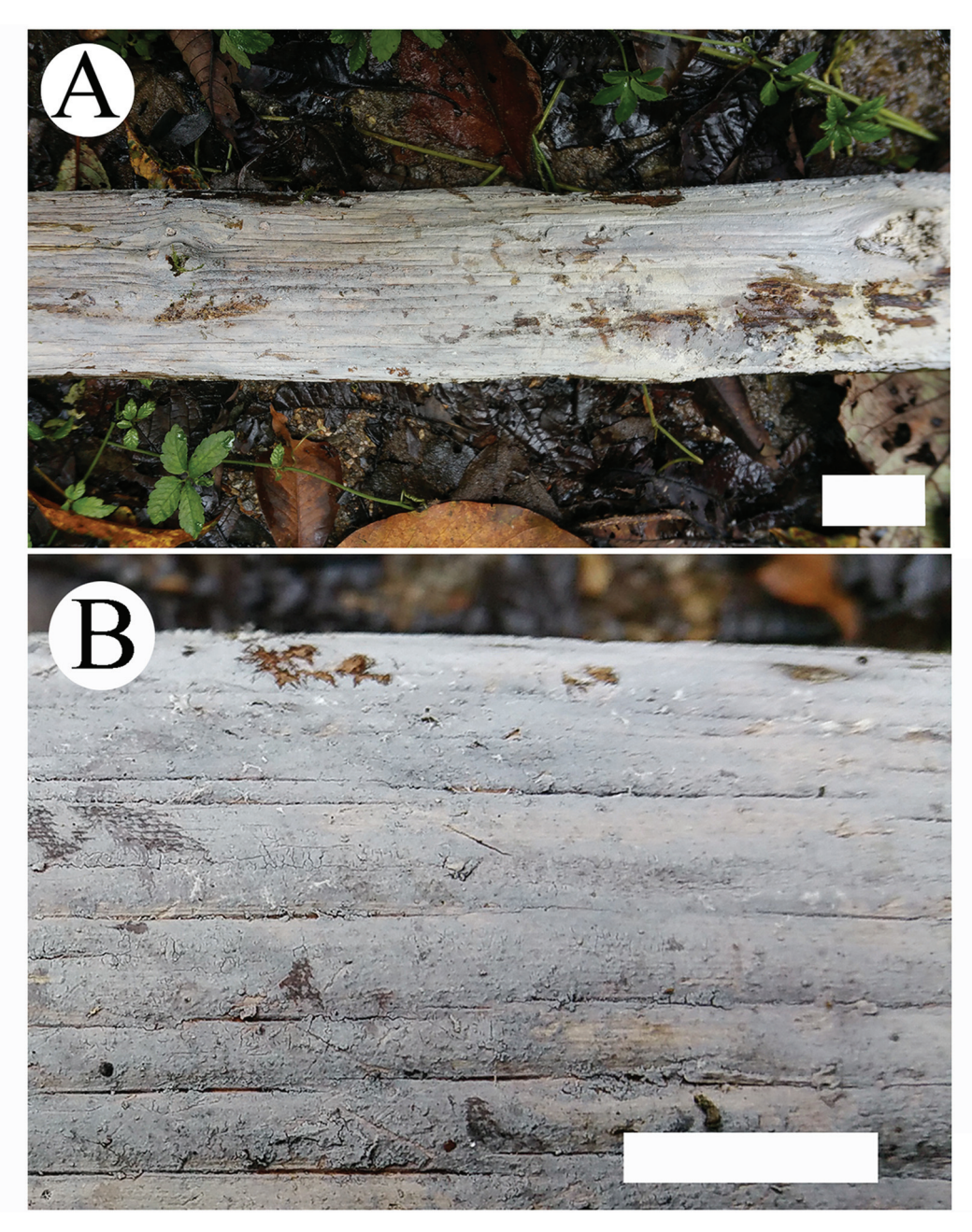
FIGURE 1. A basidiomata of Phlebiella ailaoshanensis (holotype). Scale bars: a-1 cm. b-0.5 cm.

Hyphal structure:—Hyphal system monomitic; generative hyphae with clamp connections, thin-walled, branched, 1.5–2.5 μm in diam., IKI–, CB–; tissues unchanged in KOH.