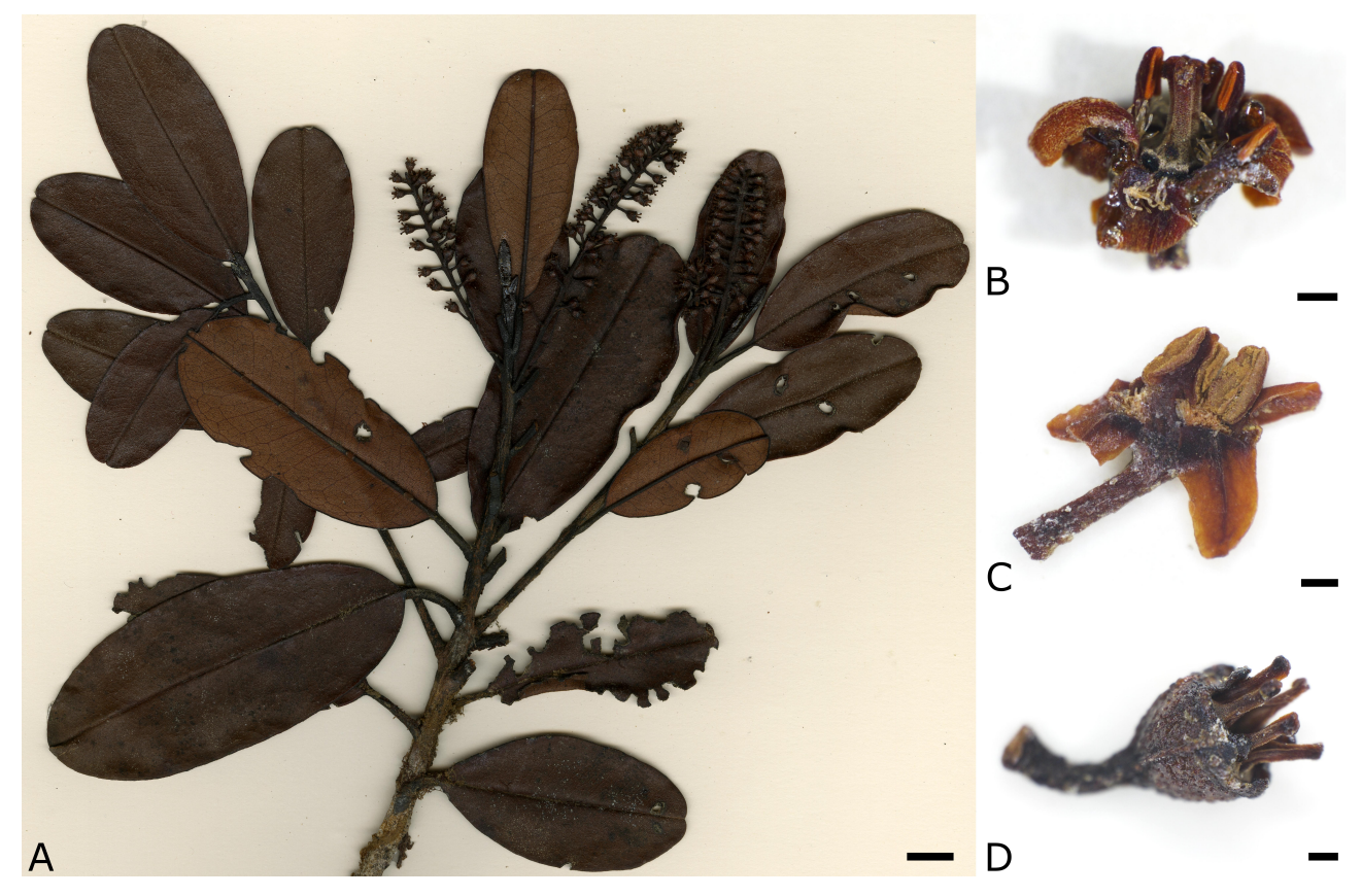
FIGURE 2. Quintinia hyehenensis Pillon & Hequet. A. Branch with fruits; B. Female flower; C. Male flower; D. Fruit. A & D: Pillon et al. 349; B: MacKee 24460; C: McPherson 19087. Scale bars: A: 1 cm; B, C, D: 0.5 mm.

Distribution and habitat: —This species occurs in high elevation shrublands and forests between 600 and 1500 m elevation, on Mounts Panié, Ignambi and Colnett and on roches Ouaïème (FIG. 4). This species may also be present on Mount Aoupinié, from where a single collection in bud, McPherson 3400 (NOU!, P!), matches Q. hyehenensis with its coriaceous and retuse leaves, but further material (flowers at anthesis or fruits) is desirable to confirm its presence in this location, which is much further south than the other collection localities.