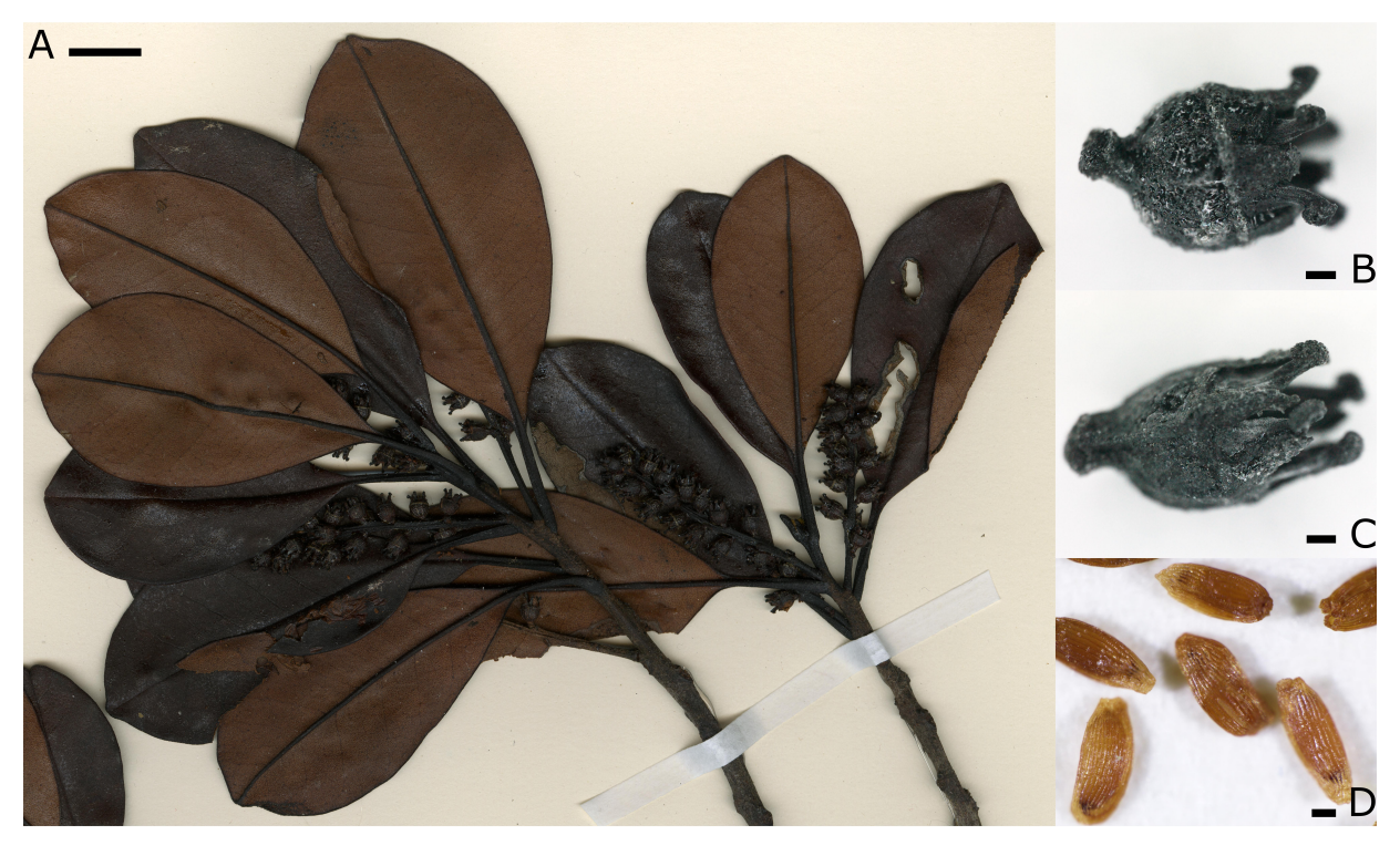
FIGURE 3. Quintinia sessiliflora Pillon & Hequet. A. Branch with fruits; B. Fruit; C. Fruit; D. Seeds. A, B & D: McPherson et al. 19370 ; C: Munzinger et al. 1648 . Scale bars: A: 1 cm; B & C: 0.5 mm; D: 100 μm.

Shrub or tree, 2–6 m, circumference of trunk up to 17.5 cm ( fide Munzinger et al. 3425 ). Young parts including buds glabrous and resinous. Stipules absent. Leaves simple, alternate, petiole 1–2 cm × 1.5–2.5 mm, leaf blade 4–8 × 2–4.2 cm, coriaceous, elliptic to slightly obovate, base acute, apex broad, often with a somewhat broad mucro, glabrous, covered with black glandular dots on the lower surface, margin entire, minutely revolute; venation brochidodromous, not very distinct, primary venation impressed on the upper side, 6–10 pairs of secondary veins. Inflorescence resinous, an axillary spike 3–6 cm long with 12–20 flowers. Bracts 3 × 1 mm. Flowers sessile or with a very short pedicel (< 0.5 mm), tetramerous or pentamerous, glabrous. Flower buds 1.5 mm long × 1 mm in diameter. Flowers at anthesis unknown. Fruit: a septicidal capsule, glabrous, 4–5 locules, unilocular at maturity, placentation parietal, subglobular, 1.5–2.5 mm long, 2.5–3 mm in diameter, longitudinally ridged. Sepals free, 4–5, tongue-shaped, 1.2–1.5 × 0.5 mm, erected and persistent on fruit. Style persistent, 1.5 mm long, stigma capitate with 4 papillose lobes separating in opening fruits, alternate to sepals. Seeds c. 20 per fruit, flat, ellipsoid c. 1 × 0.2–0.3 mm, truncate at the base, pointed to truncate at the apex.