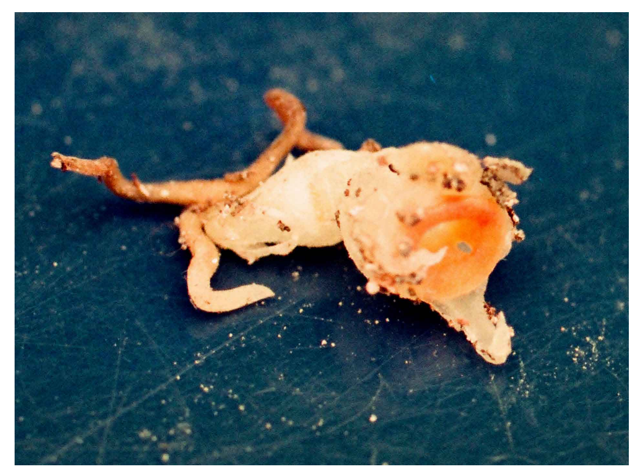
FIGURE 1. Thismia kobensis (holotype) from the type locality.

Terrestrial, achlorophyllous, mycoheterotrophic herbs. Roots creeping, vermiform, branched, ca. 1 mm in diameter, whitish when young, pale brown when old. Stem erect, ca. 1 mm long. Leaves glabrous, whitish, scale-like, narrowly triangular to ovate, 1.0-5.0 \times 0.4-3.0 mm, apex obtuse to acute; largest leaves just below flower. Involucral bracts, white, similar to upper leaves. Flower solitary, subsessile, pubescent. Perianth actinomorphic with 6 tepals fused to form a basal perianth tube. Perianth tube white, hexagonal prismatic apically and urceolate basally, 8 \times 3-7 mm, narrowing just above the ovary, widest at the upper apex; inner surface without transverse bars; apex with a broad, prominent, hexagonal annulus. Inner tepals 3, larger than outer tepals, white, ca. 5.4 \times 1.1-1.3 mm, arching inward distally and connate apically to resemble a mitre, apex acuminate; outer tepals 3, white, ca. 4 \times 1 mm, apex acuminate. Stamens 6, free from each other, pendulous from the annulus, annulus dark orange, connective yellow; each stamen rectangular with 4 thecae; each theca oblong, ca. 0.6 \times 0.1 mm; nectariferous gland absent; connective of stamens without lateral appendages, not forming a skirt-like appendage; apex of each stamen truncate with long hairs. Ovary inferior, cup-shaped, 2.5 \times 1.5 mm, pubescent; style ca. 0.45 mm long; stigma trilobed, ca. 1.0 mm long; stigma lobes triangular or arrow-shaped with a long hair on each lobe.