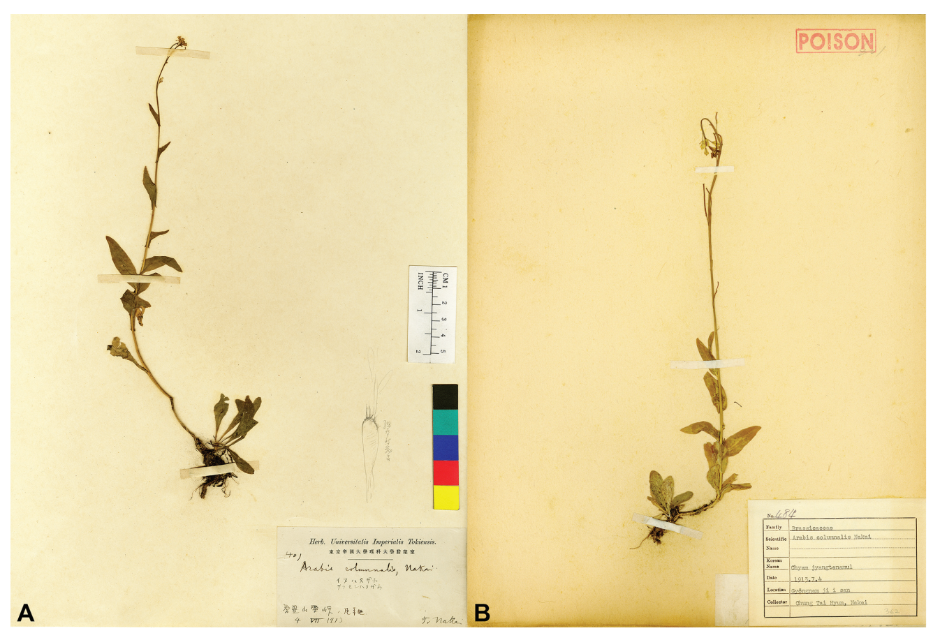
FIGURE 1. Type specimens of Arabis columnalis Nakai (T. Nakai 401). A. Lectotype (TI). B. Isolectotype (SKK).

Even now, taxonomists accept A. columnalis as a taxon in the genus Arabis (Warwick et al. 2006, Oh 2007, Suh et al. 2009, Chang et al. 2014, Chung et al. 2017, Kim 2017). Nevertheless, the delimitation and taxonomic status of the aforementioned taxa are still unclear due to the lack of keys for identification of relevant taxa.