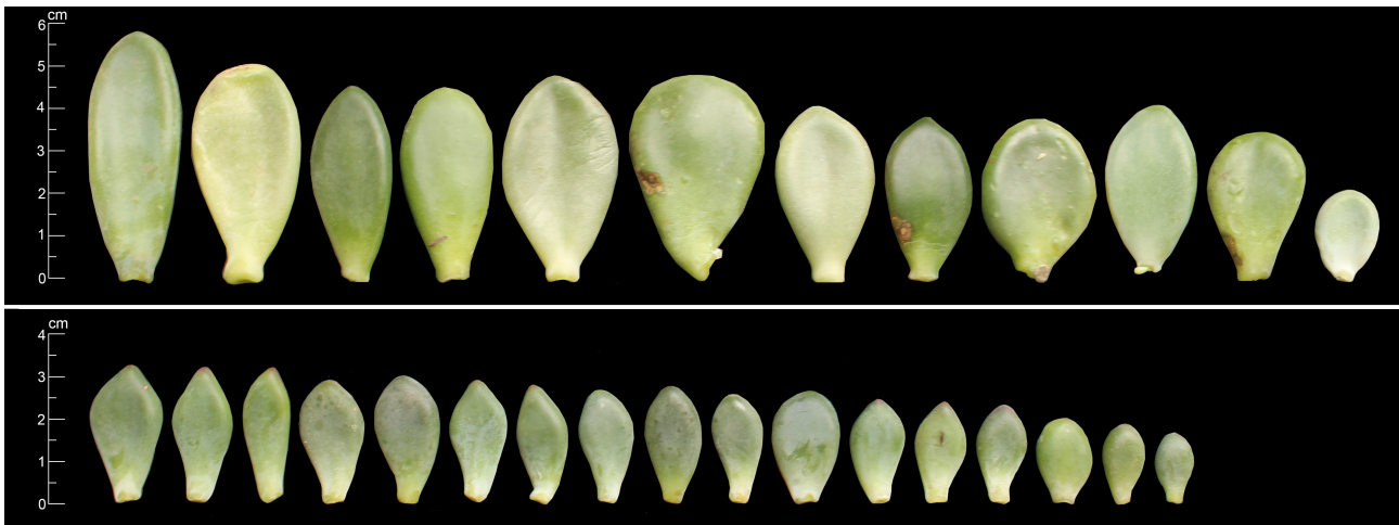
FIGURE 3. Leaf shape and size variation of: A) Pachyphytum rogeliocardenasii ; B) Pachyphytum garciae .