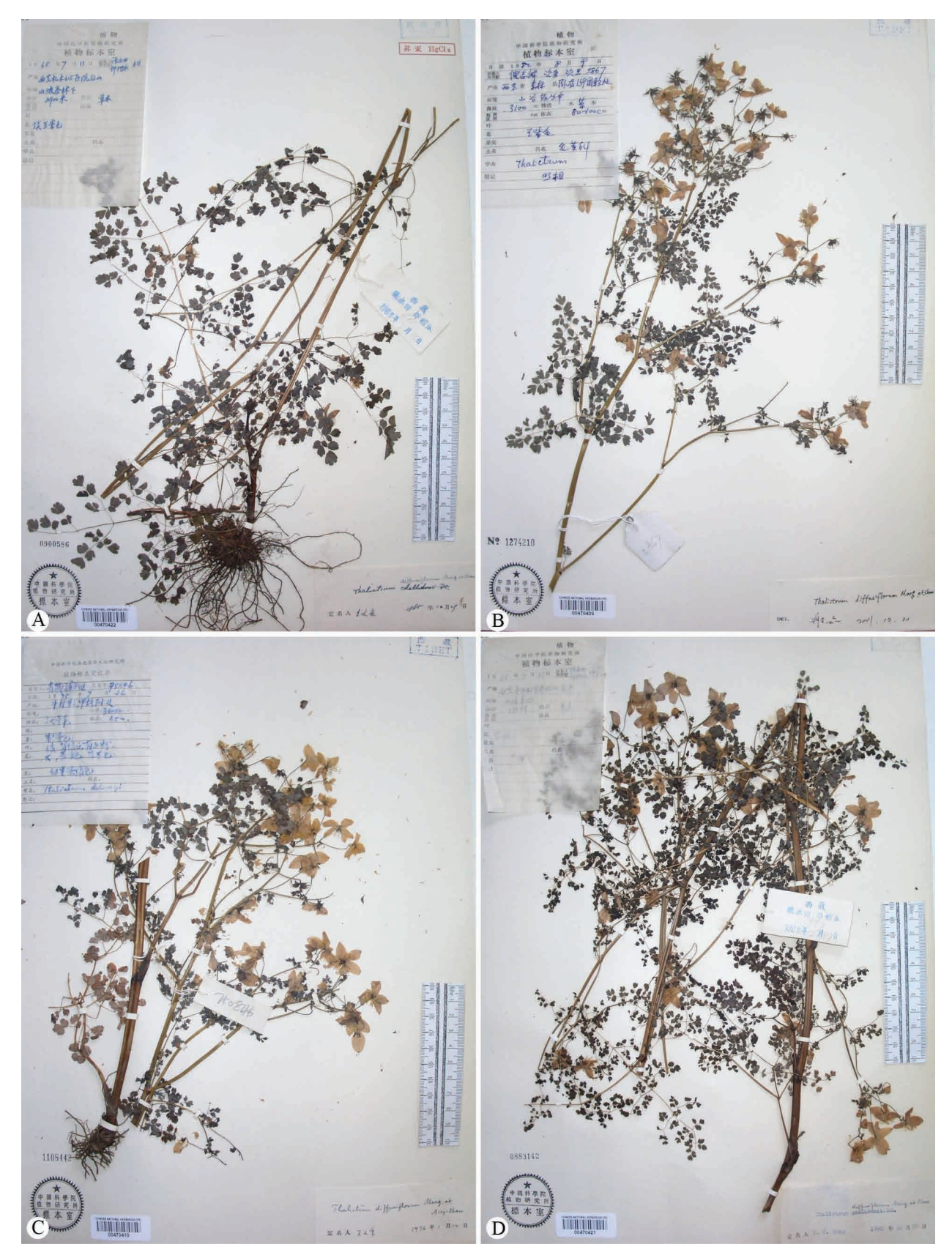
FIGURE 3 . Specimens of Thalictrum diffusiflorum . A. China, south-east Xizang, Bomi, Zamu, Y.T. Chang & K.Y. Lang 611 (PE). B. China, south-east Xizang, Mainling, Wolong, C.C. Ni et al. 2867 (PE). C. China, south-east Xizang, Mainling, Jiage, C.C. Ni et al. 2867 (PE). C. China, south-east Xizang, Nyingchi, Lulang, Y. T. Chang & K.Y. Lang 997 (PE).