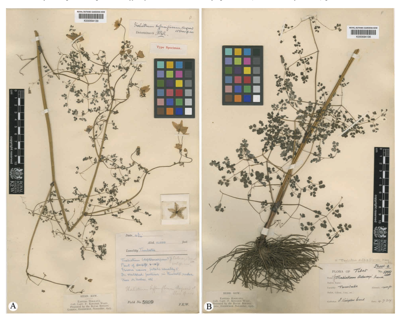
FIGURE 2. Holotype sheet (A) and isotype sheet (B) of Thalictrum diffusiflorum.

In having relatively larger flowers, Thalictrum diffusiflorum is somewhat similar to T. delavayi , a species fairly common in west Guizhou, west Sichuan, south-east Xizang, and Yunnan, China (four specimens from south-east Xizang are shown in Fig. 4 for the convenience of comparison). The former is most readily distinguishable from the latter, among other characters as given by Wang (2013) for distinguishing between T. callianthum and T. delavayi , by the stem, leaves, inflorescence axis, pedicels and carpels being all more or less glandular pubescent (vs. glabrous) and, as indicated by the specific epithet "diffusiflorum", the usually quite lax (vs. relatively dense) panicle.