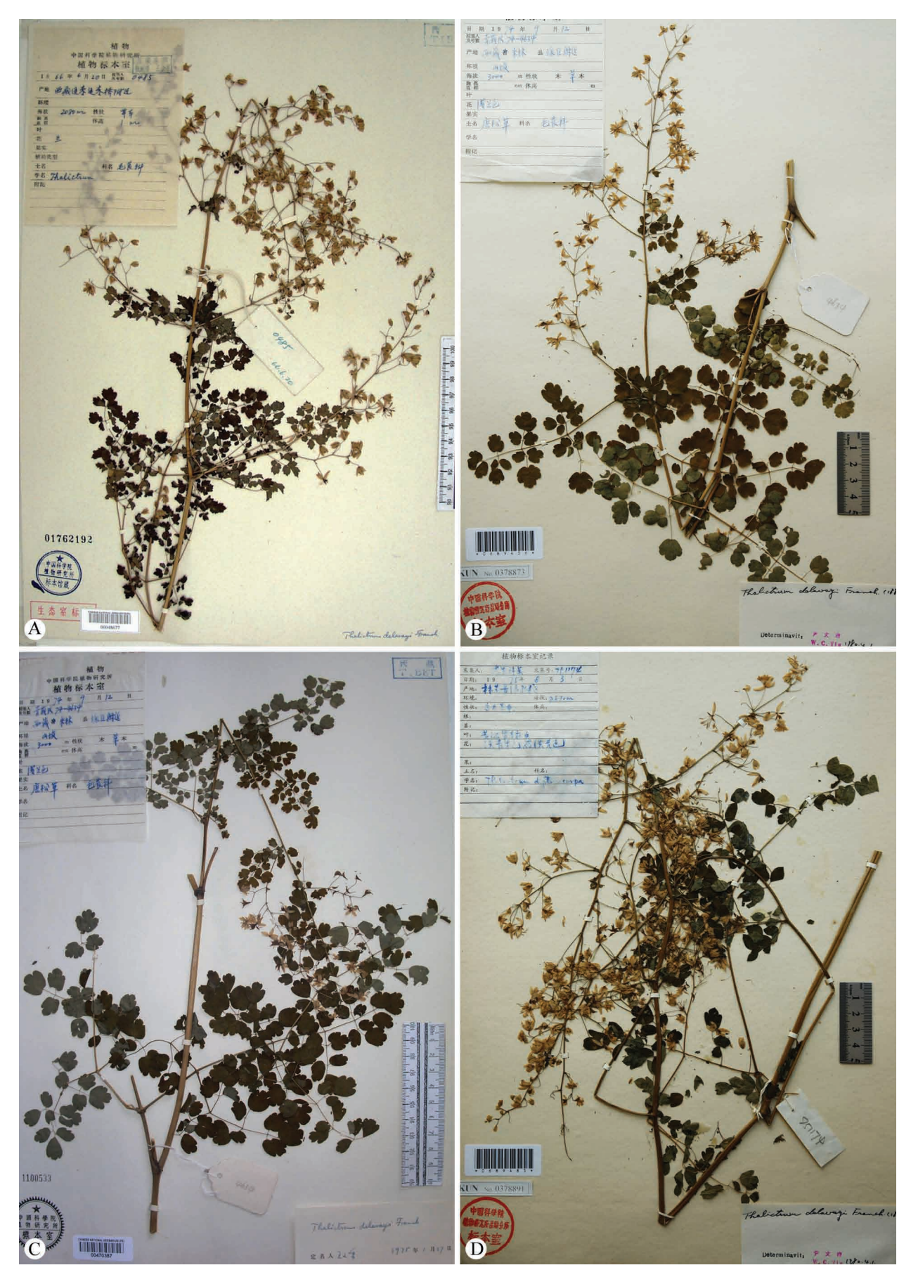
FIGURE 4. Specimens of Thalictrum delavayi . A. China, south-east Xizang, Bomi, Tongmai, J.W. Zhang & J.T. Wang 0485 (PE). B. China, south-east Xizang, Mainling, Paiqu, Qinghai-Xizang Exped. 74-4634 (KUN). C. Same locality, Qinghai-Xizang Exped. 74-4634 (PE). D. China, south-east Xizang, Nyingchi, Lulang, Qinghai-Xizang Suppl. Exped. 751174 (KUN).