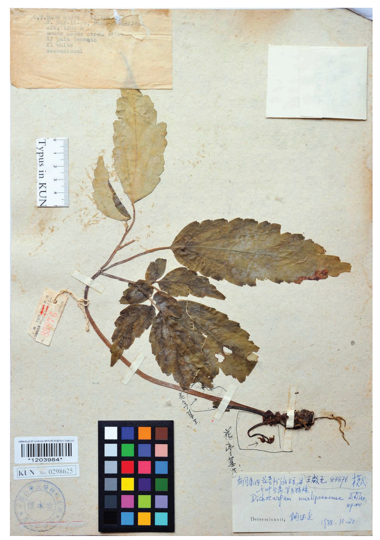
FIGURE 2. Holotype sheet of Dichocarpum malipoense (= D. hypoglaucum ).

1970 but without precise collection date, the latter in March 23, 2002), are already full-grown plants. From these two gatherings it is evident that the scape bears a much larger cyme and exceeds the basal leaves in height. The gathering Anonymous 6111 (HITBC) includes two fruiting plants (only one is shown here), while the specimen Y.M. Shui et al.