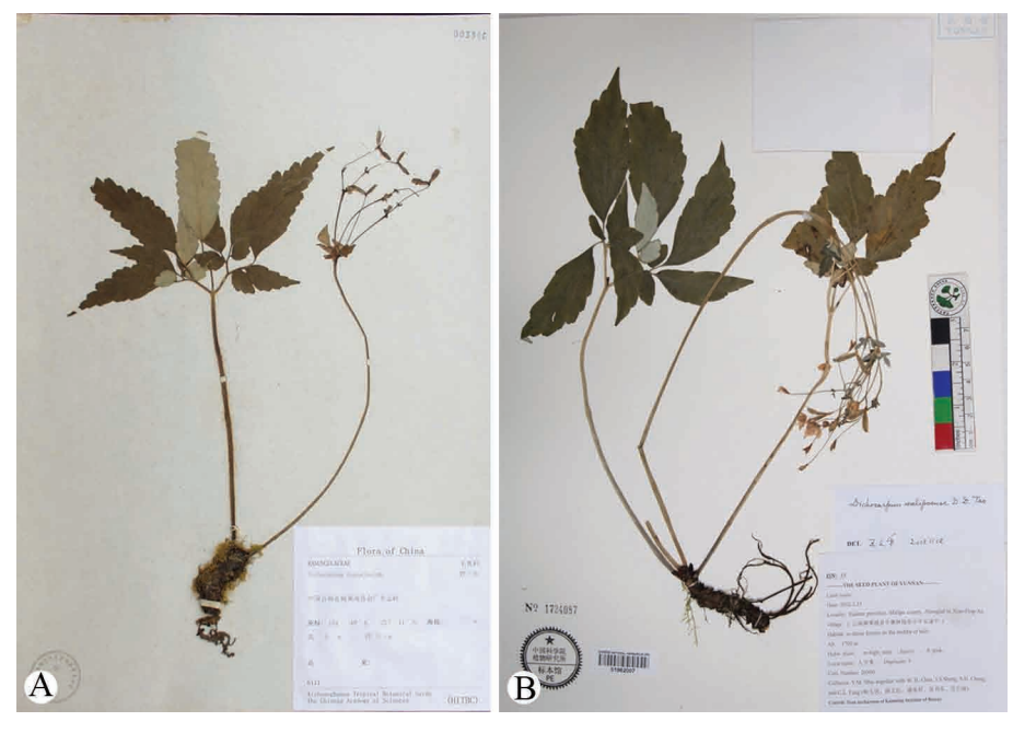
FIGURE 4. Specimens of Dichocarpum hypoglaucum . A. China, Yunnan, Malipo, Anonymous 6111 (HITBC). B. Same locality, Y.M. Shui et al. 20300 (PE; previously identified as D. malipoense ).