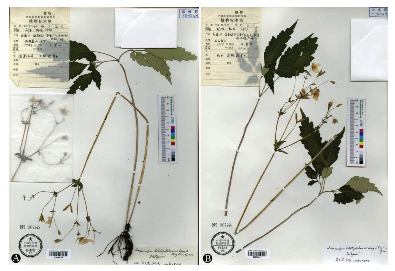
FIGURE 3. Holotype (A) and isotype (B) sheets of Dichocarpum lobatipetalum (= D. hypoglaucum ).

From the above analyses we deem it justifiable to place both Dichocapum malipoense and D. lobatipetalum in synonymy with D. hypoglaucum . The following taxonomic treatment is necessary.