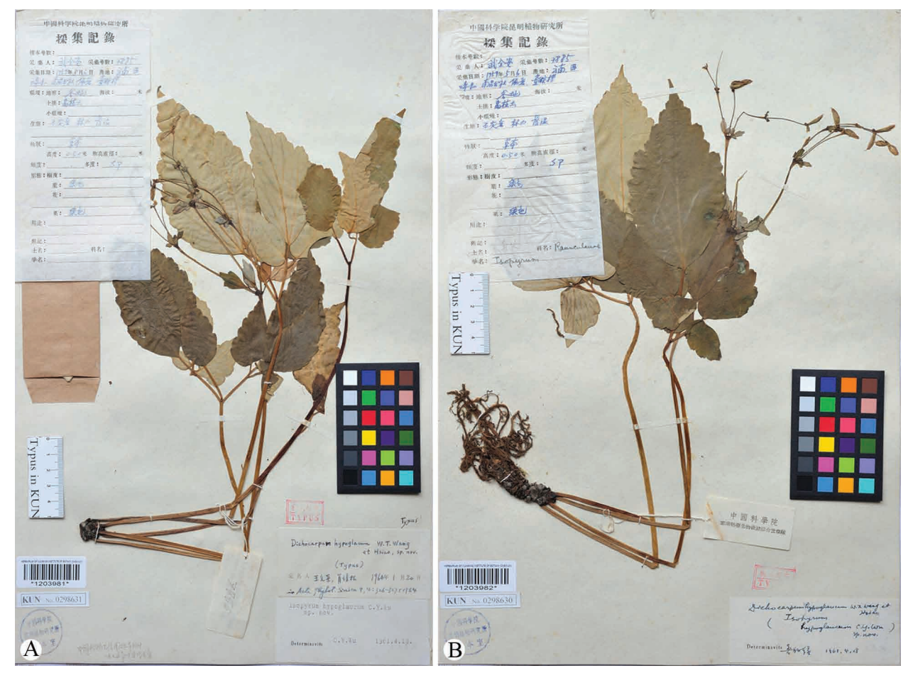
FIGURE 1. Holotype (A) and isotype (B) sheets of Dichocarpum hypoglaucum.

The report of the occurrence of three Dichocarpum species with so similar leaflets (generally much larger than those of the remaining species in the genus and abaxially glaucous) in south-east Yunnan, a limestone area, caught our attention. The aim of this paper is to determine the identity of D. lobatipetalum and D. malipoense , both of which were later published than D. hypoglaucum .