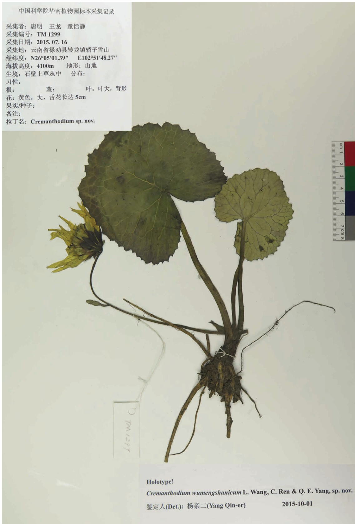
FIGURE 1. Holotype sheet of Cremanthodium wumengshanicum .

outer phyllaries lanceolate, apex acuminate or caudate; inner phyllaries oblong, margin membranous, apex acuminate; bracts 10–14, oblong or narrowly ovate, 3–5 mm long, 2–3 mm broad, apex acuminate. Ray florets yellow; lamina lanceolate, 1–5 cm long, 4–7 mm broad, apex acute or acuminate, usually 3-denticulate. Tubular florets numerous, yellow, 1 cm long; tube 3 mm long; limb campanulate. Achenes brown, oblong, 3 mm long, 6–10-ribbed. Pappus white or sometimes purplish brown, 6–8 mm long, as long as or slightly shorter than tubular corolla.