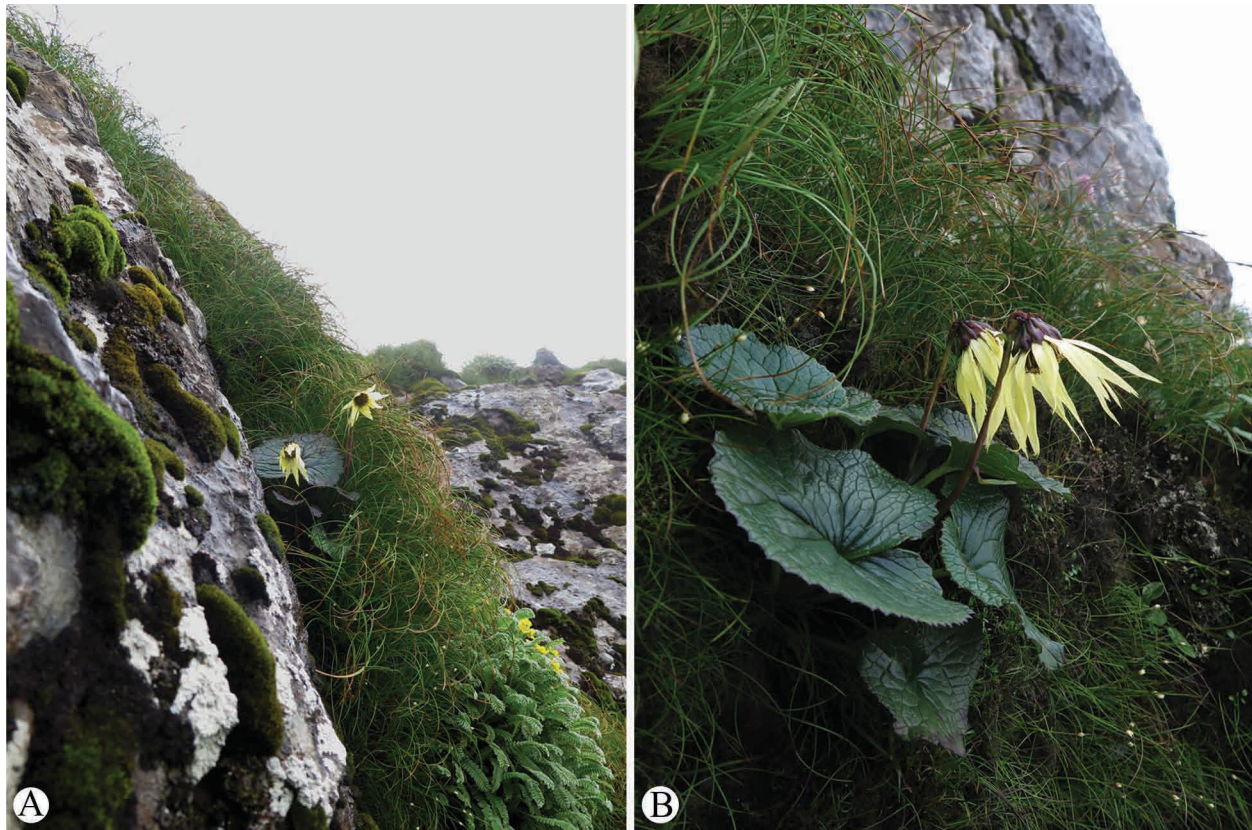
FIGURE 2. Cremanthodium wumengshanicum in the wild (Jiaozi Xue Shan, Luquan, Yunnan, China). A. Habitat. B. Habit.

Distribution and Habitat: — Cremanthodium wumengshanicum is currently known from northeastern Yunnan (Dongchuan, Luquan), China (Fig. 4). It grows in alpine meadows or cliff crevices between 3500 and 4300 m above sea level.