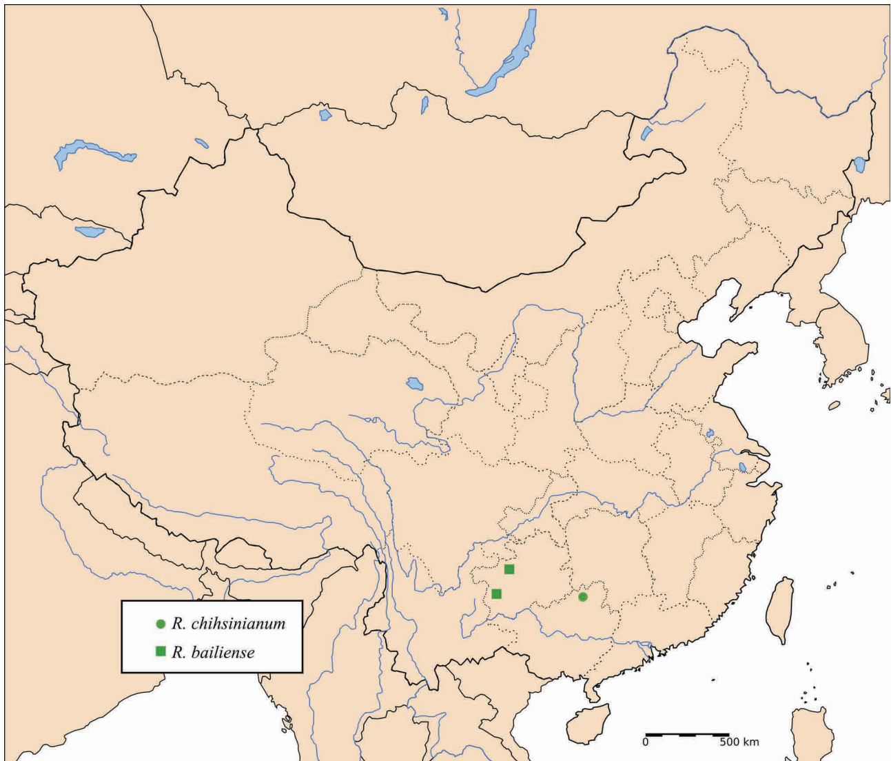
FIGURE 1. Geographical distribution of Rhododendron baliense and R. chihsinianum (detailed distribution information of R. chihsinianum was obtained from Chinese Virtual Herbarium, http://www.cvh.org.cn ).

Distribution and ecology: —To date, Rhododendron baliense has only been found from two localities in the region of Baili Rhododendron Nature Reserve (27°14'24"N; 105°52'42"E), NW Guizhou and in Pan County (26°02' N; 104°55' E), W Guizhou, China. The species has been found in rock outcrops on Karst Limestone at an elevation of 1800–2100 m (Figure 1).