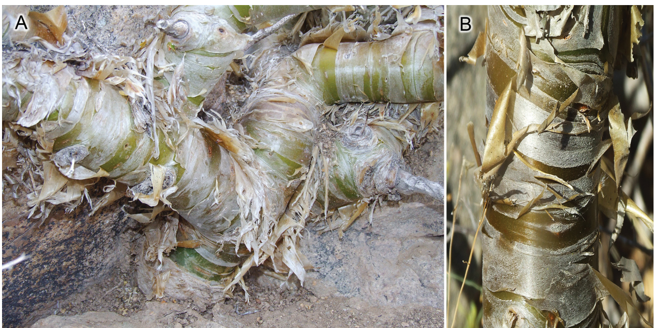
FIGURE 2. Commiphora namibensis . Old stems showing flaky bark. (A) Base of plant with low branching, growing tightly wedged among rocks; (B) trunk.