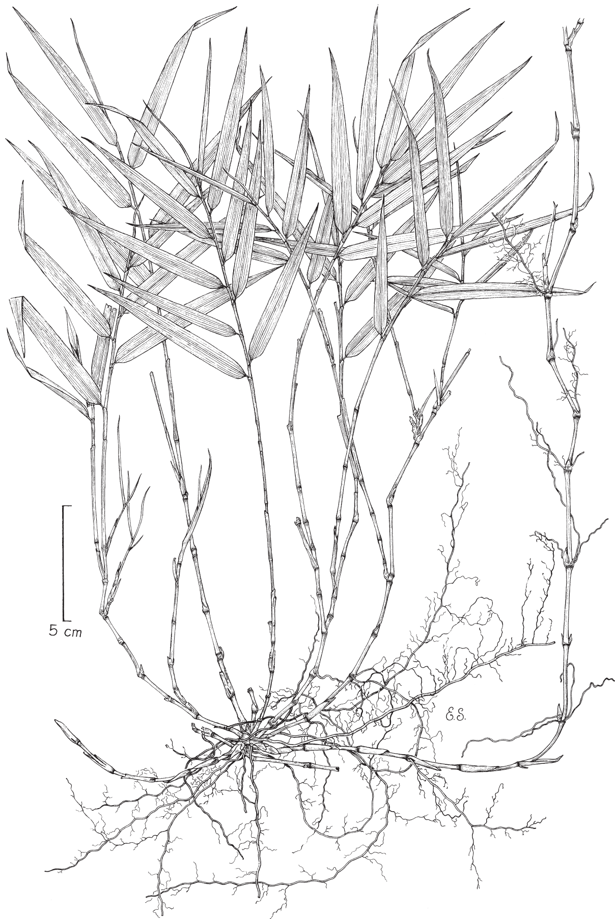
FIGURE 1. Chusquea enigmatica . Complete plant with leptomorph rhizomes (right, vertical orientation). Based on E. Ruiz-Sanchez & T.M. Mejía-Saulés 434a. Drawn by Edmundo Saavedra.