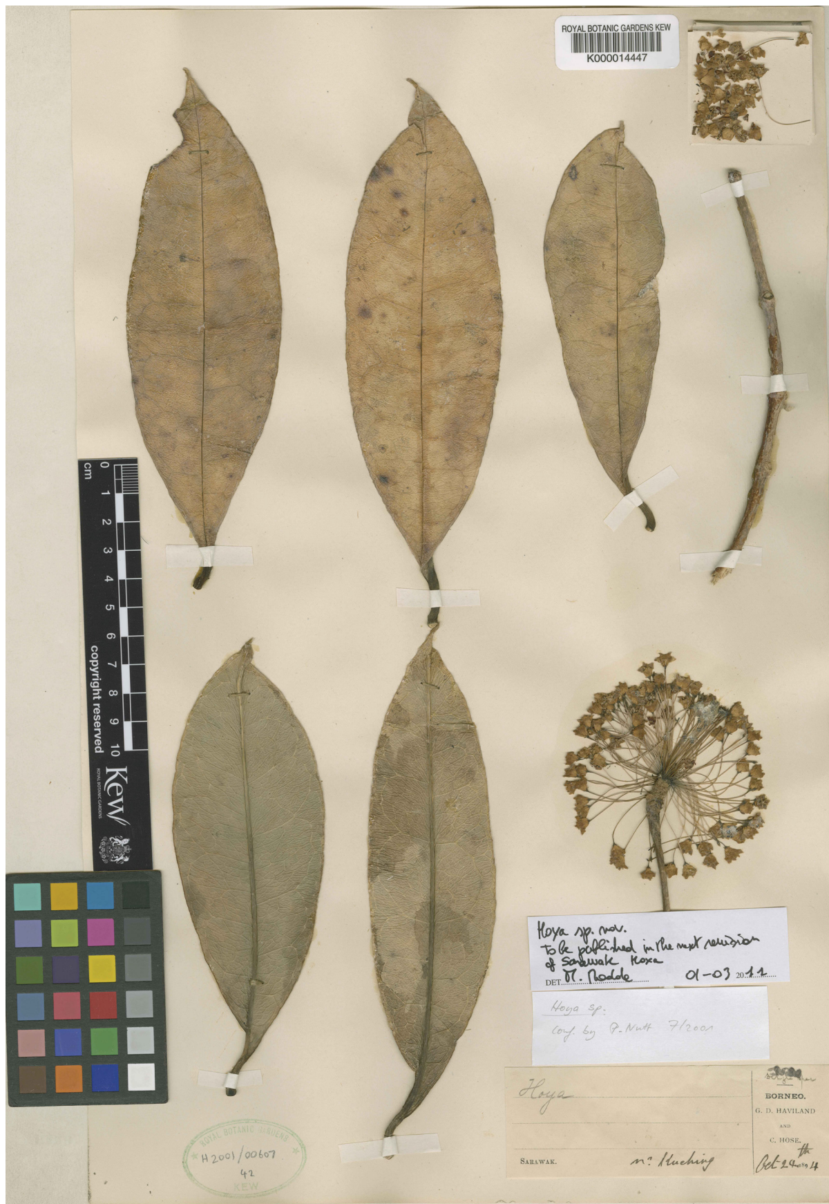
FIGURE 2. Photograph of the holotype of Hoya nuttiana , Haviland & Hose 8530 (K).