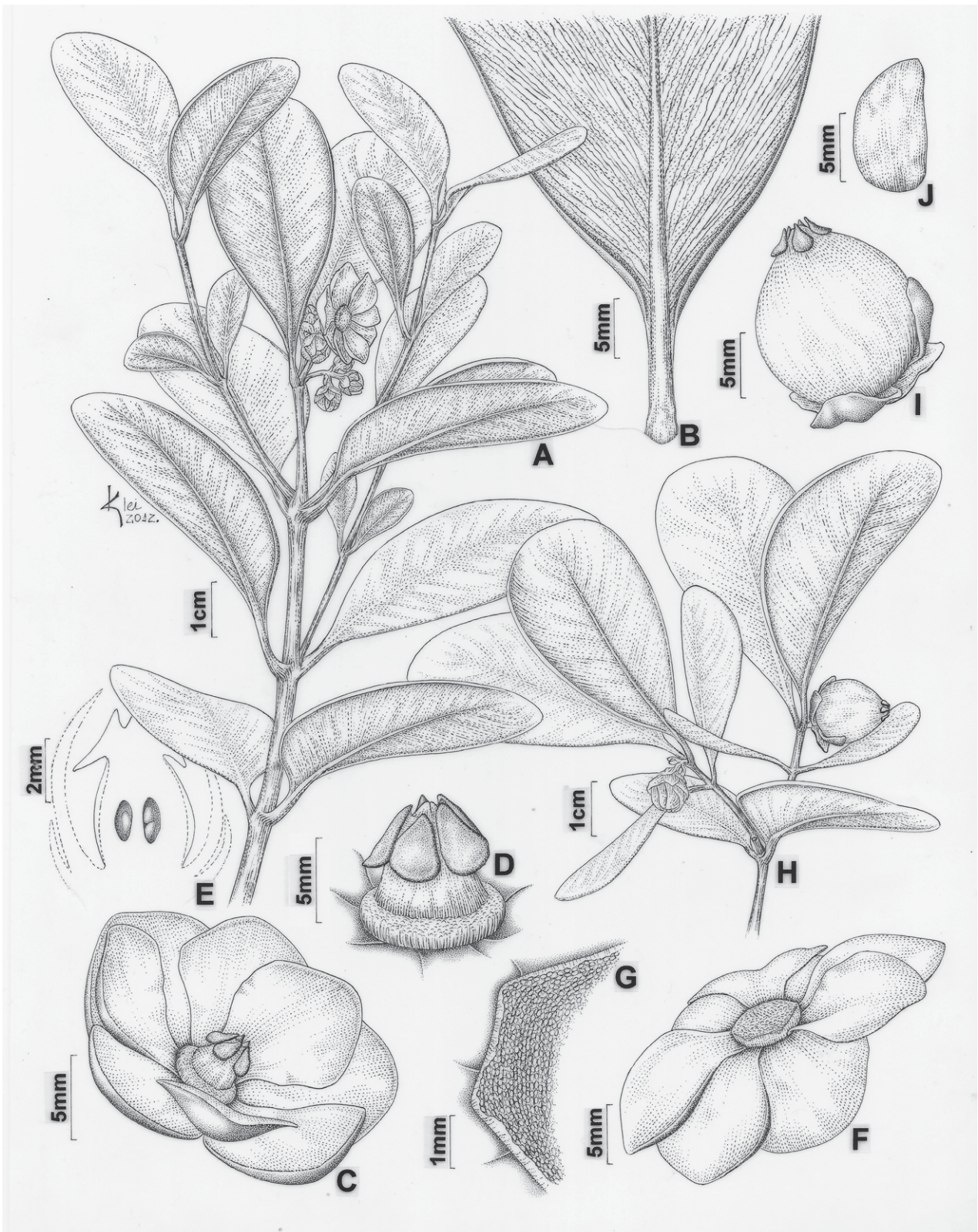
FIGURE 2. A. Disposition of leaves and inflorescences. B. Leaf venation and latex channels. C. Pistillate flower. D. Detail of pistil and staminodes. E. Longitudinal section of ovary. F. Staminate flower. G. Detail of androecium. H. Disposition of leaves and fruit. I. Immature fruit. J. Seed. A, F–G from F.N. Cabral 82 ; B–E & H–J from F.N. Cabral 23 . Drawing by Klei Souza.

apical, yellowish, obtusely triangular, flat, 2.5 mm long; ovary yellow, ovules 1 or 2(–3) per locule. Immature fruit oval to hemispherical, 15–22 x 13–19 mm, usually finely longitudinally striate with latex canals; sepals, staminodes and stigmas persistent, valve endocarp not conspicuously hardened. Seeds 1 or 2(–3) per locule, 5.0–9.0 x 3.5–5.0 mm, green, aril orange.