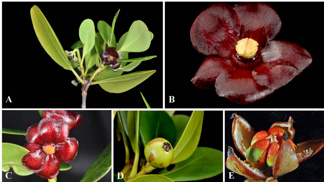
FIGURE 1. A. Disposition of leaves and inflorescences, F.N. Cabral 49 (Photo F.N. Cabral). B. Pistillate flower, F.N. Cabral 123 (Photo F.N. Cabral). C. Staminate flower, F.N. Cabral 5 (Photo F.N. Cabral). D. Immature fruit, F.N. Cabral 197 (Photo F.N. Cabral). E. Mature fruit, N. Dávila 6129 (Photo N. Dávila).

Type:—BRAZIL. Roraima: Caracaraí, Parque Nacional do Viruá, White-sand vegetation, 1°24'50.7"N, 60°59'16.5"W, 59 m, 15 October 2010, F.N. Cabral & V.S. Santos 298 (holotype INPA!).