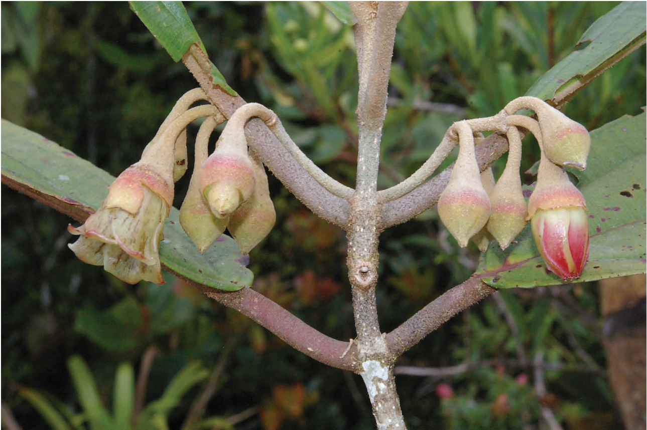
FIGURE 2. Inflorescences of Chalybea brevipedunculata (Neill 16913).

described from the same two localities in recent years, including Miconia machinazana C. Ulloa & D.A. Neill (2012: 36) (Melastomataceae), Clethra concordia D.A. Neill, H. Beltrán & Quizhpe (2012: 213) (Clethraceae), Weinmannia condorensis Z.S. Rogers (2002: 183) (Cunoniaceae), Ocotea limiticola van der Werff (2014: 360) (Lauraceae) and Lissocarpa ronliesneri B. Wallnöfer (2004: 552) (Ebenaceae).