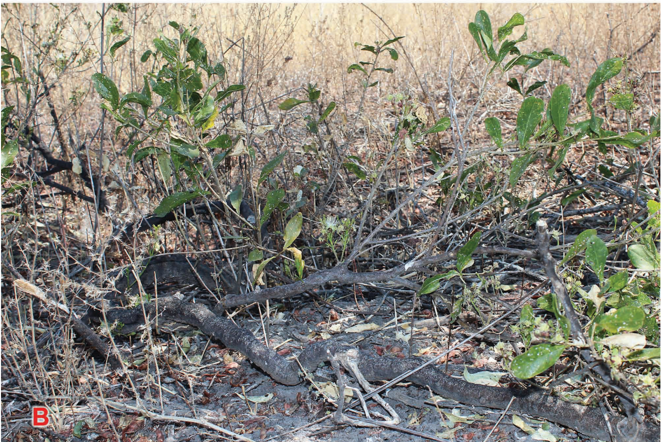
FIGURE 1. M. sebrabergensis in its natural habitat. A, clonal growth with several ramets in foreground, showing ascending shoots, \pm 0.7 m tall; trees in background are Acacia kirkii Oliver (1871: 350). B, suffrutex showing flood-exposed runner.