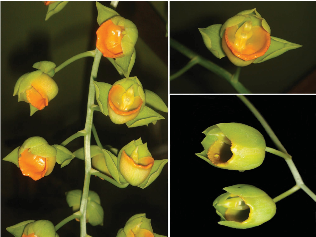
FIGURE 2. Male flowers from three specimens of the Catasetum telespirense Benelli & Soares-Lopes showing different colours and lip forms.

C. telespirense is similar to C. mattosianum Bicalho (1973:22), however it differs in the arched, semi-pendent inflorescence with the flowers distributed in the whole flower stem, resupinated lip, and color predominantly yellow (in C. mattosianum inflorescence is erect with non-resupinated flowers grouped only in the terminal portion of the stem).