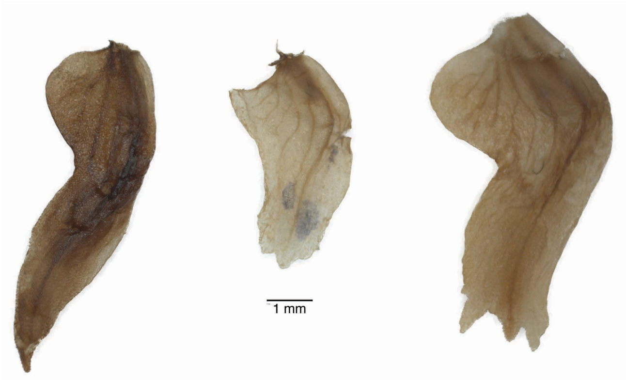
FIGURE 4. Close-up comparison of the petal of Disa montana (left), Disa staerkeriana (middle) and Disa amoena (right).