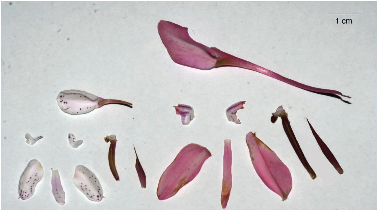
FIGURE 2. Dissected flower of Disa staerkeriana (left) and the unspeckled deep pink form of D. amoena (right).