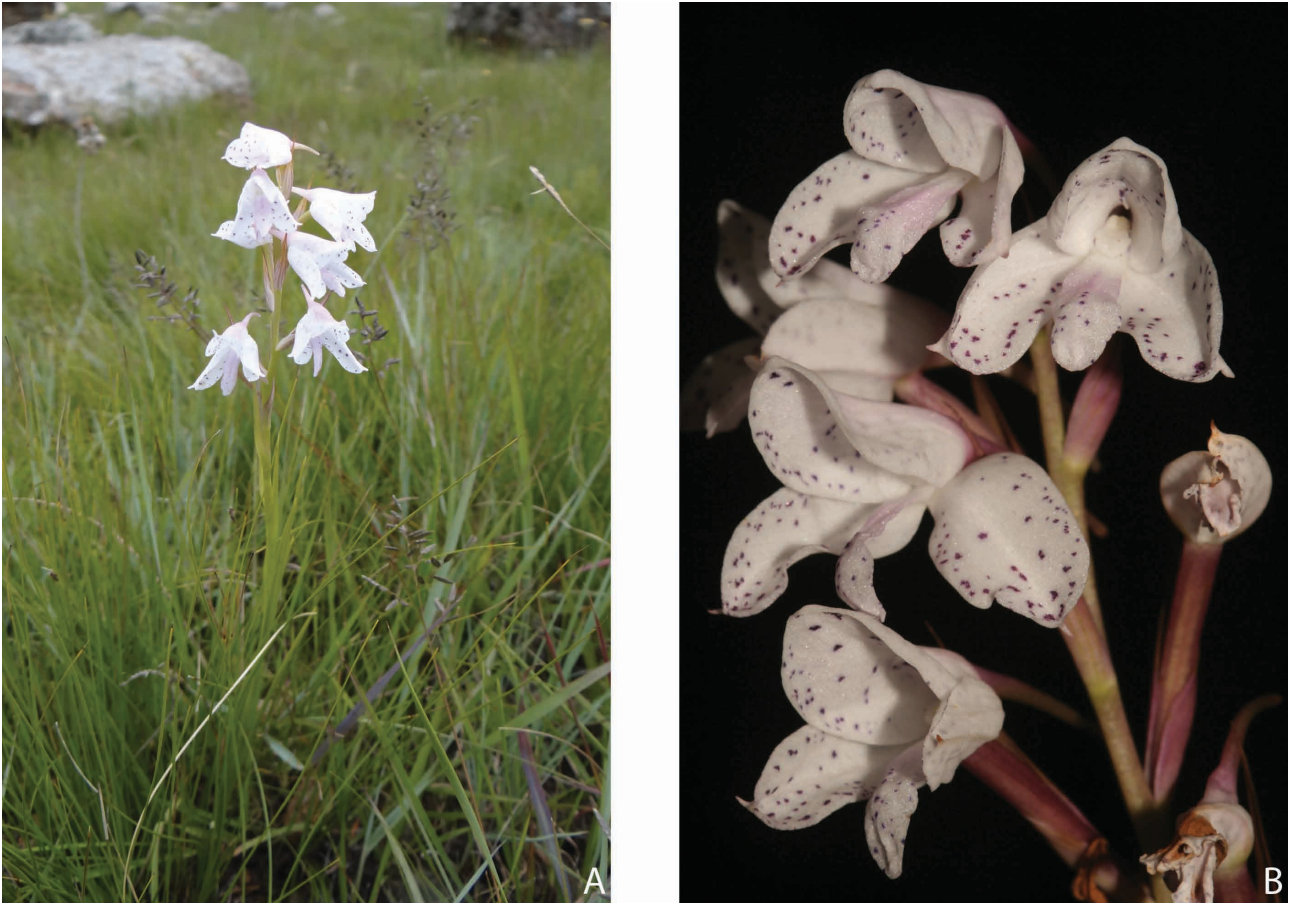
FIGURE 1. Disa staerkeriana . A. Plant in grassland habitat. B. Close up of inflorescence.

Distribution and altitudinal range: —Currently known from a single population in which 30 individuals were counted, covering an area of \pm 500 \times 700 m in size between 2160–2231 m elevation.