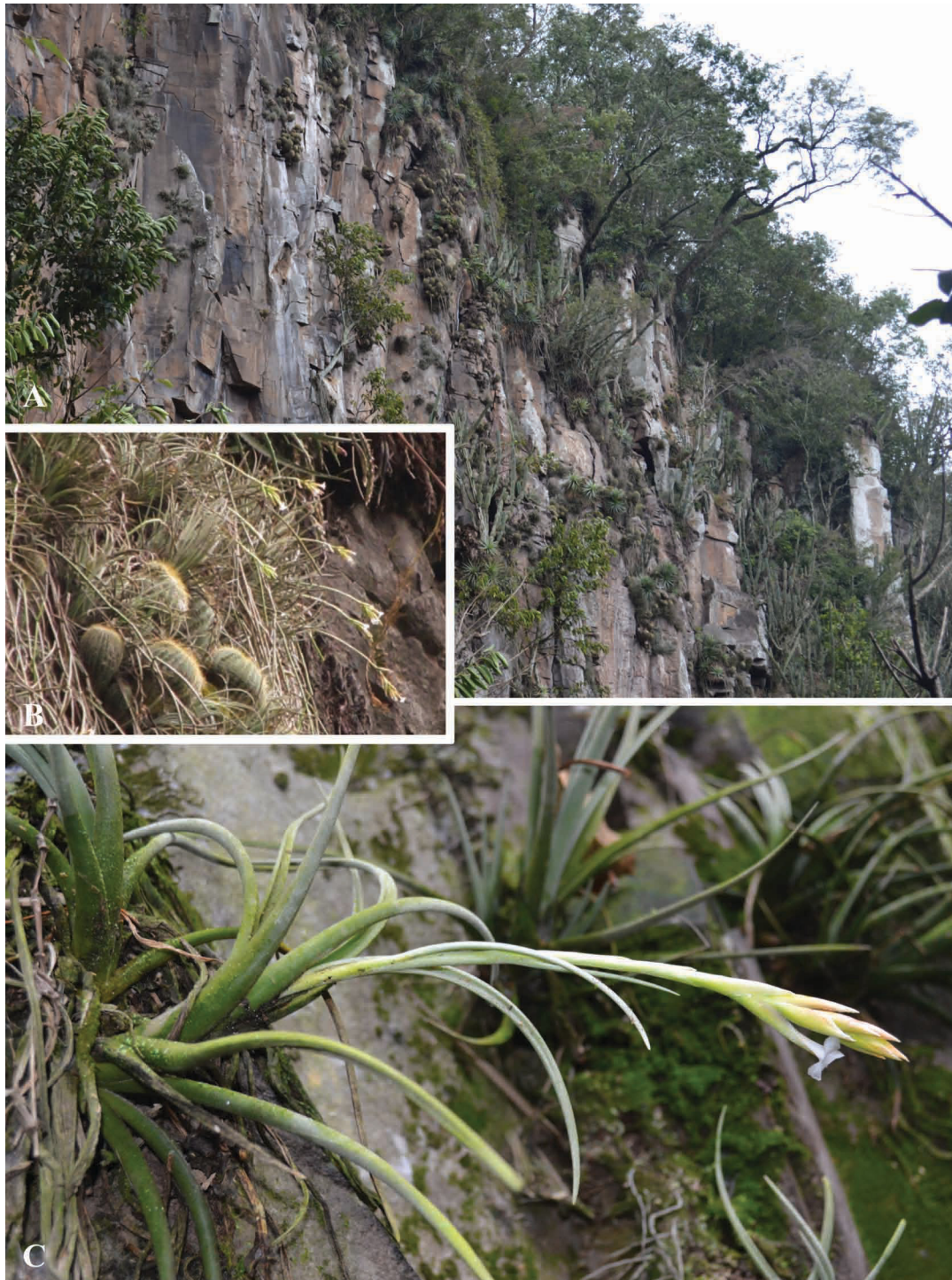
FIGURE 2. A–C. Tillandsia leucopetala (H. Büneker et al. 249). A. General view of the type locality. B. Population at the type locality in flowering, together with Eriocactus claviceps . C. Habit.

The new species is morphological closely related to T. toropiensis , which is endemic of the central region of the state of Rio Grande do Sul, growing saxicolous associated to the Cactaceae with Eriocactus magnificus Ritter (1966a: 50), on steep rocks along the Toropi River (Rauh 1984). Tillandsia leucopetala differs from T. toropiensis by its larger size (flowering up to 45 cm long vs. up to 30 cm long), longer leaf blades (12–30 cm vs. 8–20 cm), longer peduncle (12–30 cm vs. 8–19 cm), longer inflorescence (4.3–11 cm vs. 2.5–5.5 cm), with comparatively more flowers (4–11 vs. 3–7), as well as longer sepals (1.8–2.6 cm vs. 1.7–2 cm) and longer petals (up to 4 cm vs. up to 3.4 cm). Tillandsia leucopetala also differs by the color of the usually yellowish-green peduncle bracts and floral bract ( vs. reddish), and by the lepidote sepals ( vs. glabrous), having the adaxial ones connate up to the middle portion ( vs. almost completely connate).