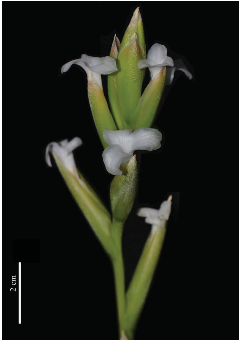
FIGURE 3. Tillandsia leucopetala (H. Büneker et al. 249). Detail of the inflorescence.

Tillandsia leucopetala has some morphological affinity with Tillandsia nuptialis Braga & Sucre (1969: 1), an endemic species from Rio de Janeiro, Brazil. However, it can be distinguished by its shorter stem, longer leaf blades (12–30 cm vs. 9–11 cm long), usually longer peduncle (up to 30 cm vs. up to 14 cm), longer inflorescence (up to 11 cm vs. up to 7 cm) with more flowers (to 11-flowered vs. ca. 6-flowered), floral bracts densely lepidote throughout the abaxial surface ( vs. lepidote at the apex only), longer petals (up to 4 cm vs. up to 3 cm) and longer sepals (up to 2.6 cm vs. up to 2.1 cm).