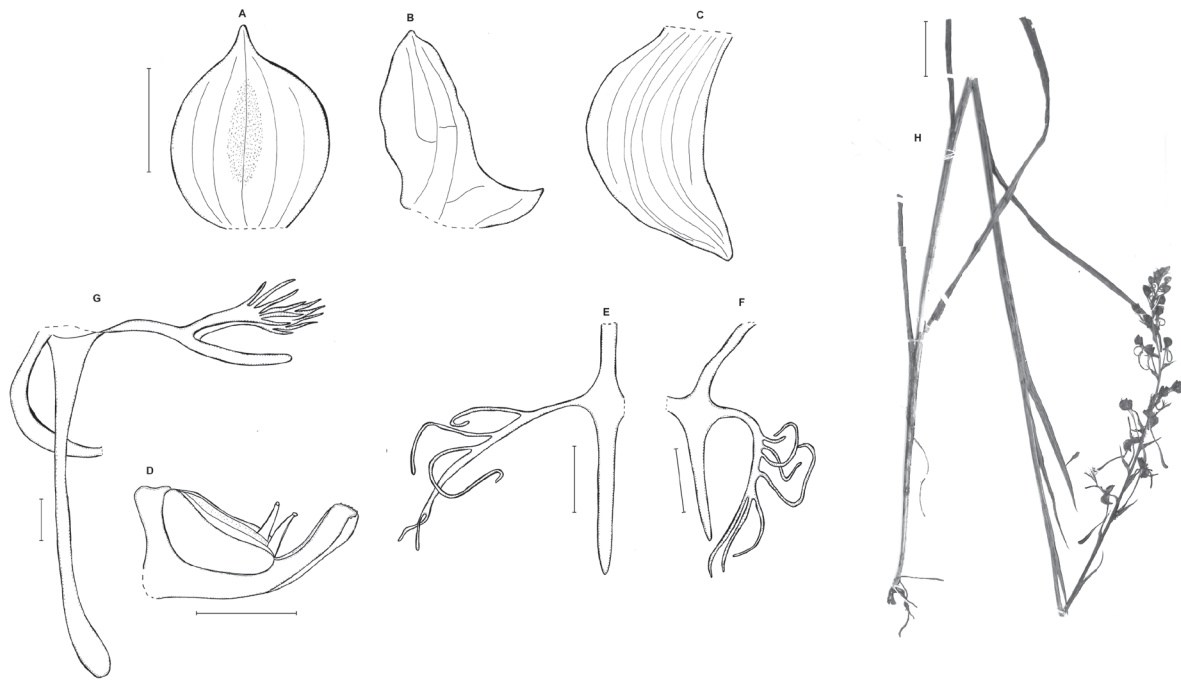
FIGURE 1. Habenaria fimbriatiloba Kolan. A, Dorsal sepal. B, Petal. C, Lateral sepal. D, Gynostemium. E–F, Lip shapes. Scale bars = 3 mm. Drawn from the holotype. G, Lip and spur. Scale bar = 3 mm. Drawn from Ye 11446 (MO). H, Plant habit. Scale bar = 3 cm.