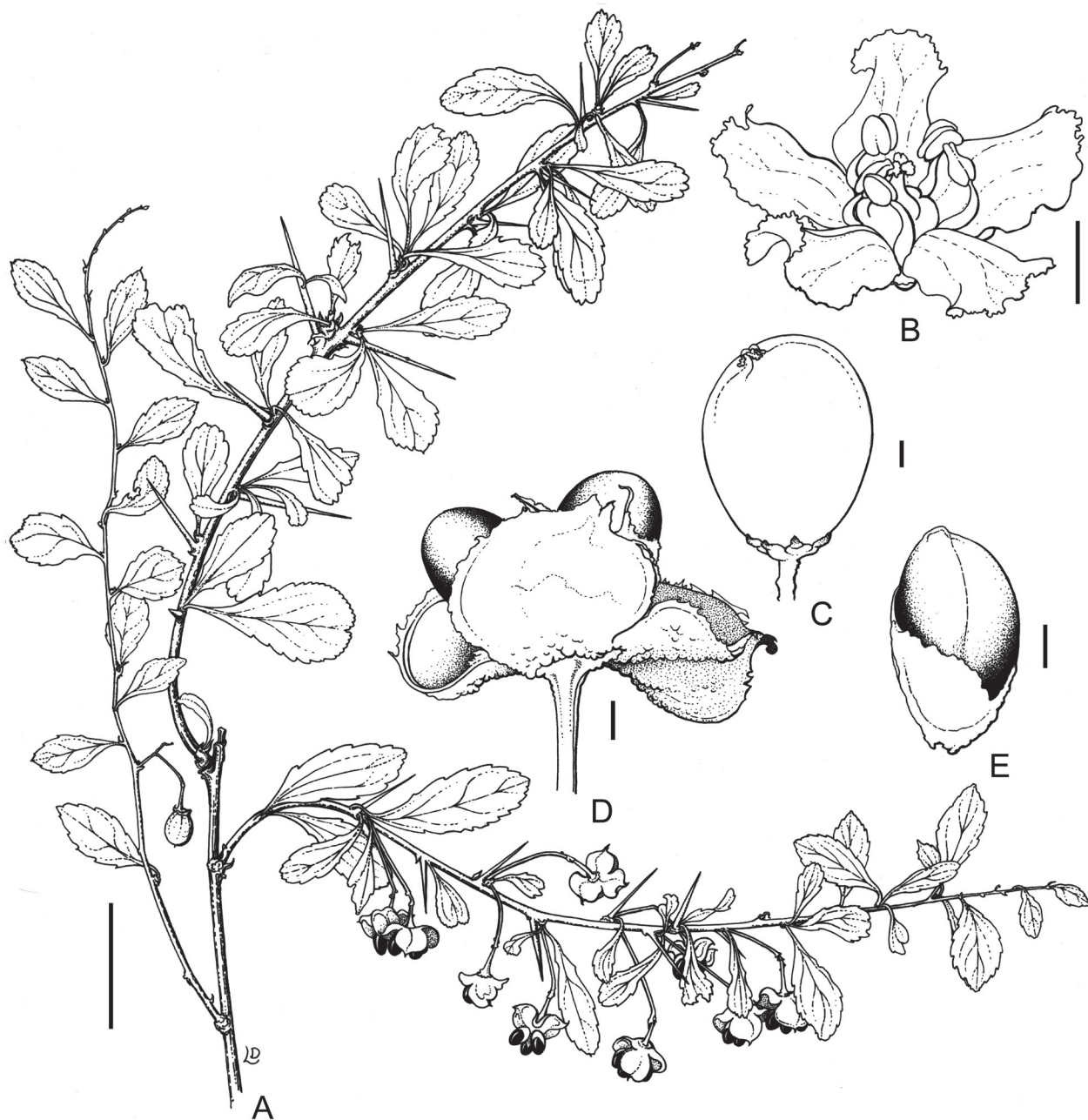
FIGURE 1. Gymnosporia swazica . A. Fruiting branch (from Jordaan 3845 ). B. Female flower (from Ward 1507 ). C. Open capsule (from Jordaan 3845 ). D. Closed capsule (from Jordaan 3712 ). E. Seed, partially covered by the aril (from Jordaan 3845 ). Drawings by Lesley Deyssel. Scale bar: A = 20 mm, B–E = 1 mm.

Small tree up to 3 m tall, usually single-stemmed, sometimes multi-stemmed, few-branched with longer branches drooping at ends, glabrous; branchlets angular, green, becoming dark grey, without lenticels. Thorns axillary, slender, up to 15 mm long. Brachyblasts up to 4 mm long. Leaves chartaceous, concolourous; lamina obovate to spatulate, 10–20(–45) × 5–10(–15) mm, apex acute to rounded to emarginate, base tapering into petiole, margin crenate, midrib prominent in lower half when dry, fading towards tip, reticulate venation conspicuous on both sides; petiole very short, almost absent. Inflorescence few-flowered; peduncle ± 2 mm long; pedicels ± 0.5 mm long. Flowers cream. Sepals oblong-lanceolate, ± 1 mm long, apex obtuse. Petals oblong, ± 1.5 mm long, margin fimbriate. Disc narrow, convex, 5-lobed. Male flowers : stamens included, ± 1 mm long; style ± 0.5 mm long; stigma absent. Female flowers : staminodes included, ± 0.5 mm long; style ± 0.5 mm long; stigma 3-lobed. Capsules globose, 3-valved, smooth, green, ripening yellow, 6–10 mm long. Seeds 1–4, dark reddish brown; aril white, partially covering the seed.