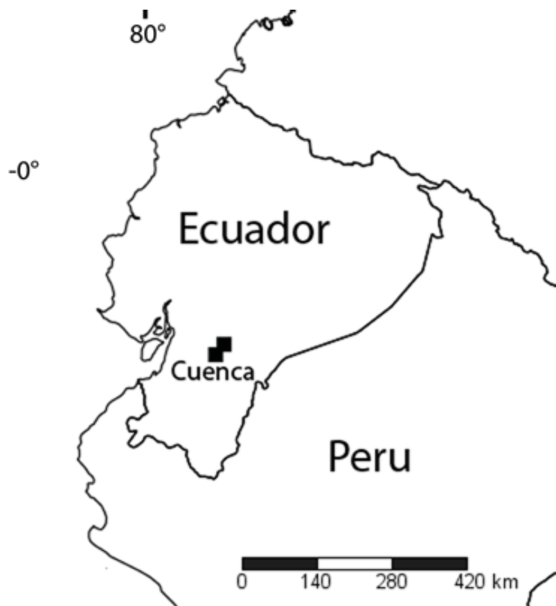
FIGURE 2. Distribution map of Phaedranassa cuencana .

Distribution and habitat: —The species is known from two populations in southern Ecuador. It grows in the inter-Andean valley of Azuay province and along the border with Cañar province (Fig. 2), on cliffs and in ravines, in heavily disturbed secondary forest with introduced Eucalyptus globulus Labill. (Myrtaceae) and Agave americana L. (Asparagaceae) and remnants of native species including Cantua quercifolia Juss. (Polemoniaceae), Dodonaea viscosa Jacq. (Sapindaceae), Echeveria quitensis (Kunth) Lindley (Crassulaceae), Epidendrum secundum Jacq. (Orchidaceae), Ferreyranthus verbascifolius (Kunth) Robinson & Brettell (Asteraceae), Scutellaria ocyroides (Kunth) Epling (Lamiaceae), and various taxa of Bromeliaceae. During full anthesis, the leaves are senescent at the base and new leaves were observed in non-reproductive plants nearby.