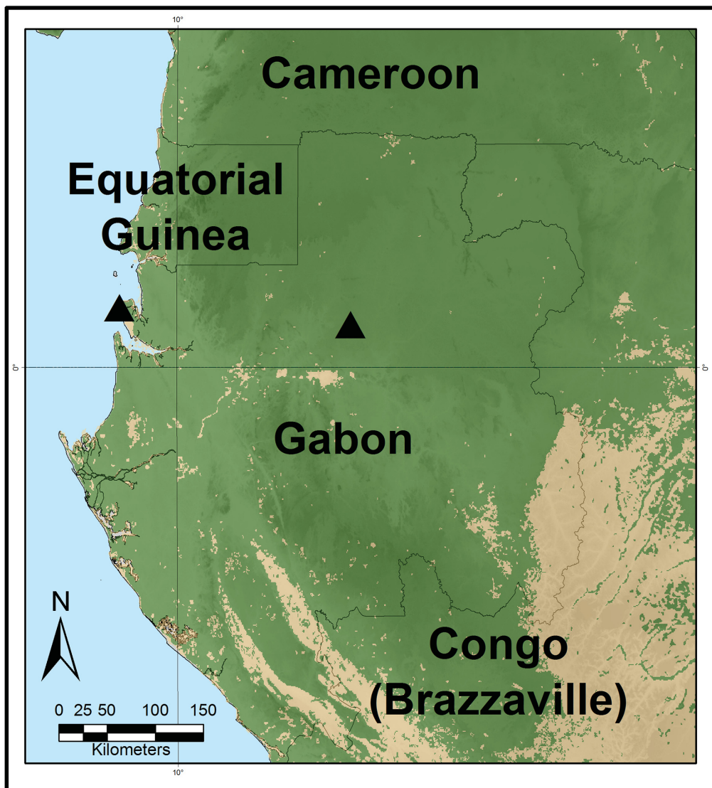
FIGURE 2. Distribution map of Monanthataxis paniculata .

Distribution: —Gabon, provinces Estuaire and Ogooué-Ivindo (Fig. 2).