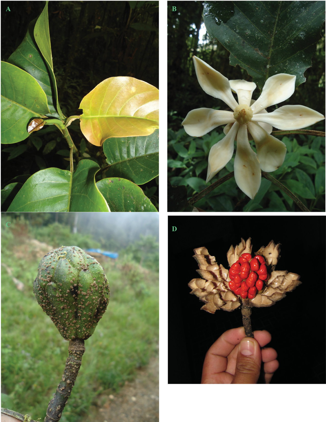
FIGURE 2. Magnolia sanchez-vegae , A. Detail of leaf base, B. Flower at anthesis. C. Obovate fruit with abundant lenticels. D. Aril

adaxial scar, (11.0–)5.7–4.0 cm long, 4 mm in diameter, glabrous, except for the apex, sometimes with hirsute hairs. Flowers terminal, solitary, floral buds oblong to obovate, 3.8–4.0 × 2.0–2.5 cm, hypsophylls 2–4, glabrous, peduncle 3.8–4.7 cm long, 6–8 mm in diameter, with sparse dark brown indumentum; sepals 3, 5.0–5.2 × 2.4–3.2 cm, navicular,