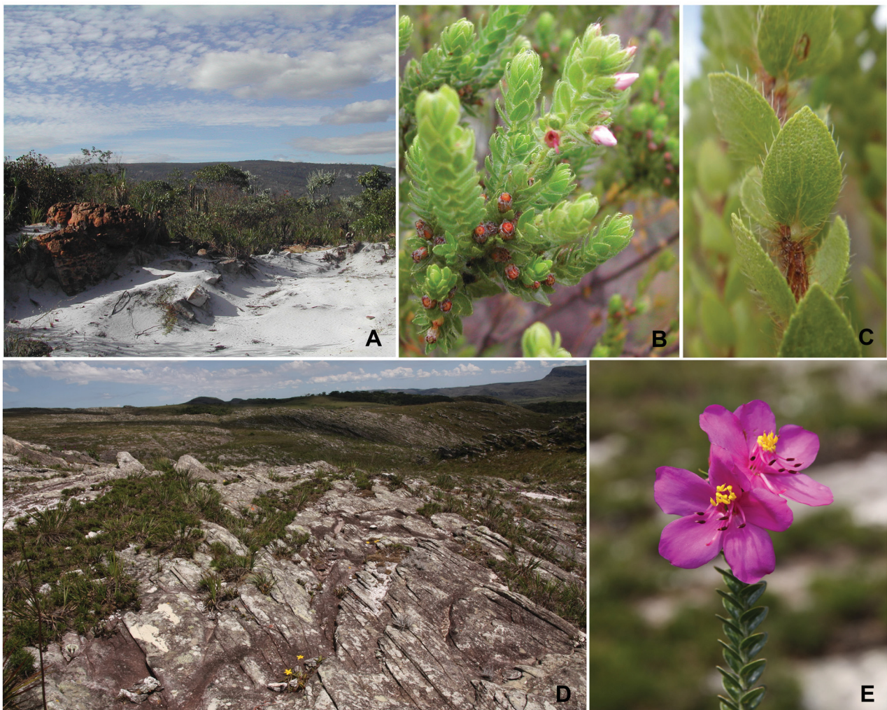
FIGURE 2. A–C Microlicia maximowicziana . A. Habitat in Grão Mogol. B. Flowering branch. C. Vegetative branch, showing horizontal to ascending leaves. D–E Microlicia riedeliana . D. Santana de Pirapama. E. Branch with 5- and 6-merous flowers. (Photos: P.O. Rosa A–B, A.F.A. Versiane C & W. Milliken D–E).

Discussion: —Digital images of collections L. Riedel 1211 , 1488 , and 1688 from BR are available from JSTOR (2014). An illustration (Fig. 1 A–M) is presented here to show the remarkable characteristics of M. maximowicziana and its relatives (Fig. 1 N–Q), as well as a photograph of a population in campo rupestre vegetation from Grão Mogol, with details of habitat, branches and leaves (Fig. 2 A–C).