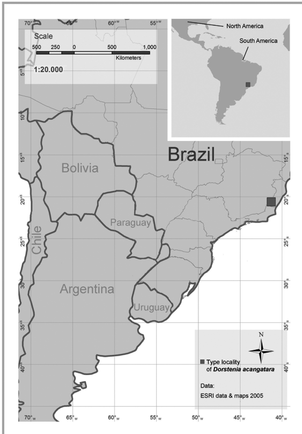
MAP 1: Location of Dorstenia acangatara populations in Brazil (Minas Gerais and Espírito Santo states).

Additional specimens examined (paratypes): —BRAZIL. Espírito Santo: Alegre, between Monte Cristo and Burarama, Florestinha, 5 Out 2009, A.F.P.Machado et al. 855; 856; 858; 874 and 875 (HUEFS, RB).