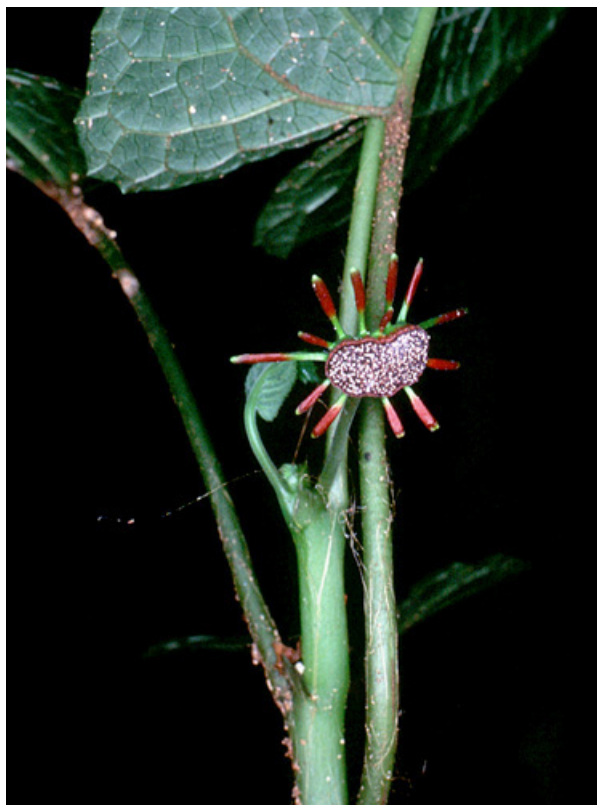
FIGURE 1: Dorstenia acangatara Photograph of the living plant in the field. (Julio Lombardi)

Diagnosis: — Similis Dorstenia albertii sed inflorescentis rubris et viridibus; margine inflorescentiae longe appendiculato-bracteata differt.