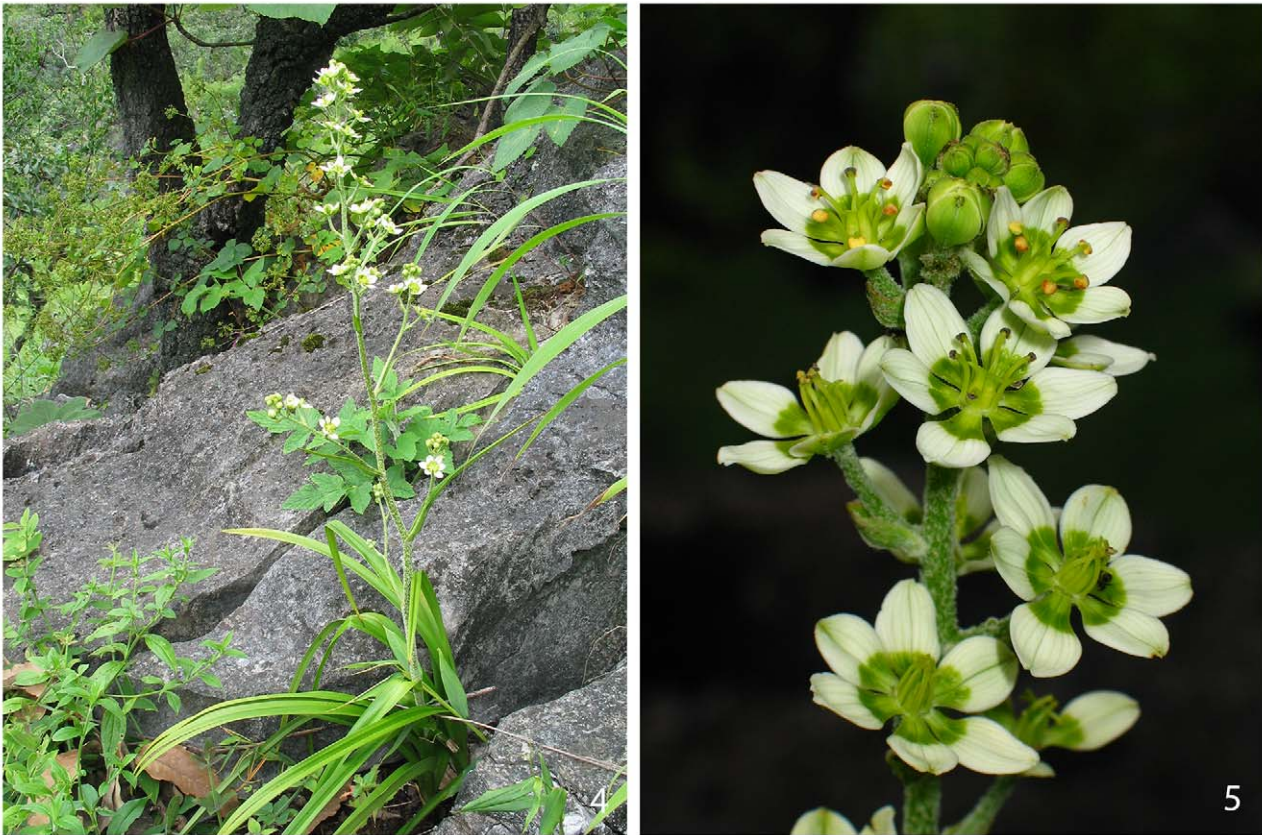
FIGURES 4–5. Veratrum mengtzeanum subsp. mengtzeanum (from: Doi Chiangdao, Chiang Mai province, Thailand).

of populations between China and Thailand suggests that the Thai populations may be genetically isolated. The regional assessment of this subspecies follows the reasoning as for the global assessment of V. mengtzeanum subsp. phuwae (see below). A preliminary assessment of Near Threatened (NT), based on the criteria of IUCN (2001), is indicated.