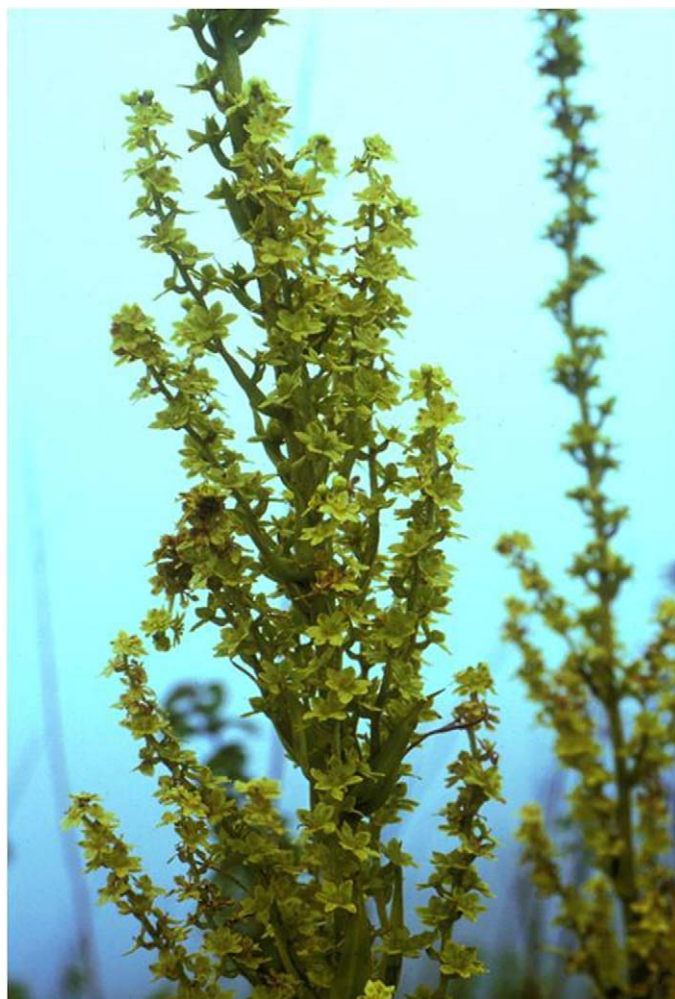
FIGURE 6. Veratrum mengtzeanum subsp. phuwae Trias-Blasi subsp. nov. (from type locality).

calculated as 4 km 2 based on a user defined cell width of 2 km 2 , which suggests this taxon meets criterion B2 under Critically Endangered. The specimens only had general locality information, and thus georeferencing was imprecise; the EOO could not be calculated. It is likely that more individuals could be found in suitable habitats in nearby areas, in which case the EOO might increase to over 100 km 2 , and this taxon might then be classed as Endangered. Even though specimens show that this population is still extant, it is strictly restricted to limestone outcrops, resulting in a fragmented distribution. Limestone habitats are generally threatened in Thailand by extraction for making concrete (Wilkin et al. 2012), but this population (IUCN locations) is in a National Park; thus, it is afforded a higher level of protection. This taxon meets some conditions for CR B1+2a and VU D2, but there are no observed declines or extreme fluctuations. However, the taxon needs to be carefully monitored in Thailand as the introduction of a threat of any kind would have an impact. A preliminary assessment of Near Threatened (NT), based on the criteria of IUCN (2001), is indicated.