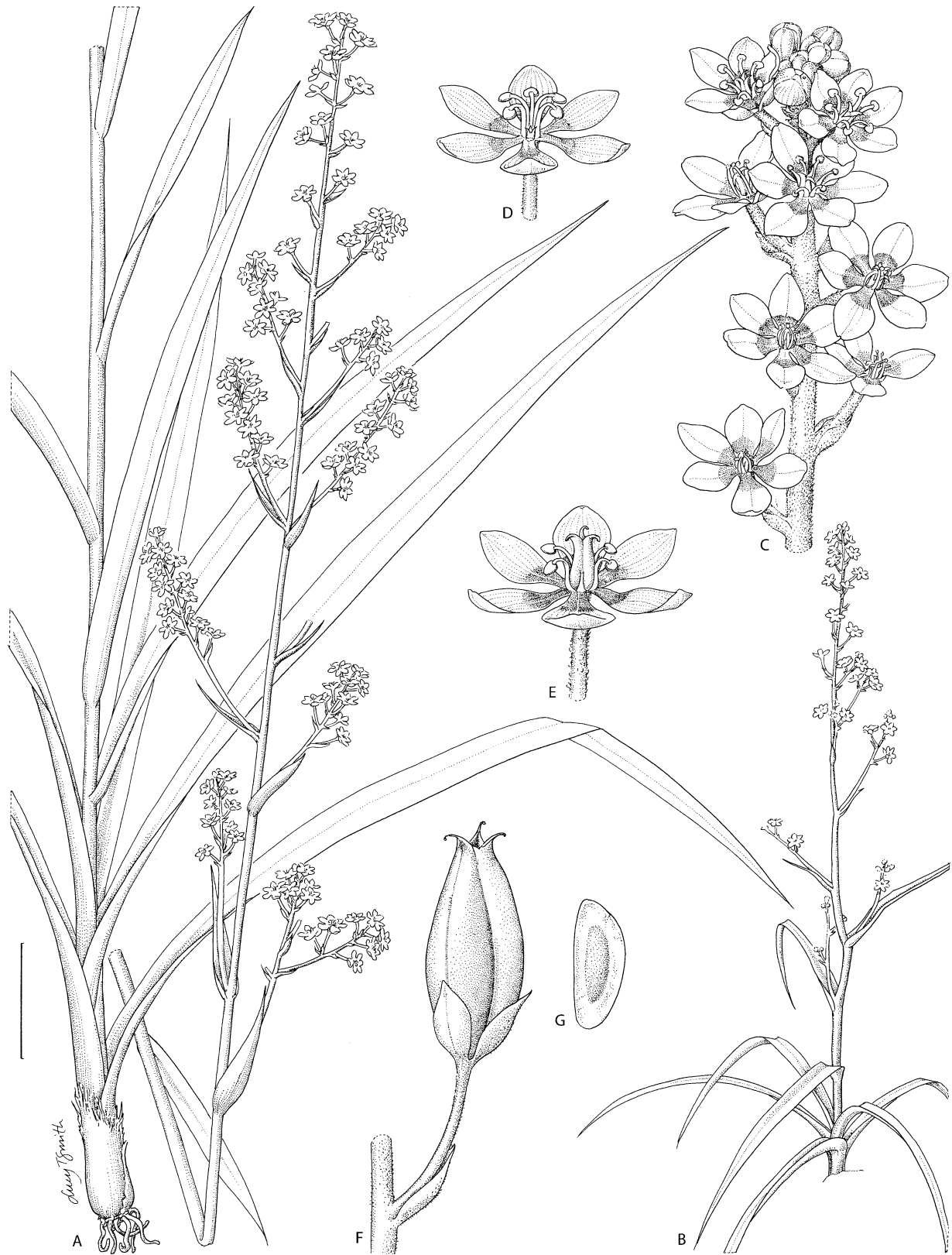
FIGURE 3. Veratrum mengtzeanum subsp. mengtzeanum : A-B Flowering habit. C. Inflorescence apex. D. Functionally staminate flower. E. Perfect flower. F. Fruit. G. Seed. A and C from Fig. 4-5. B, D and E from Forrest 22186 (K). F and G from Smitinand 7770 (BKF) (Drawings by Lucy Smith).

Nomenclature notes. —Zimmerman (1958) suggested the syntype “Henry 9979 pro parte” as the lectotype of V. mengtzeanum . However, this was not effectively published according to Article 30.7 of the Melbourne Code (McNeill et al. 2012), and lectotypification is effected here.