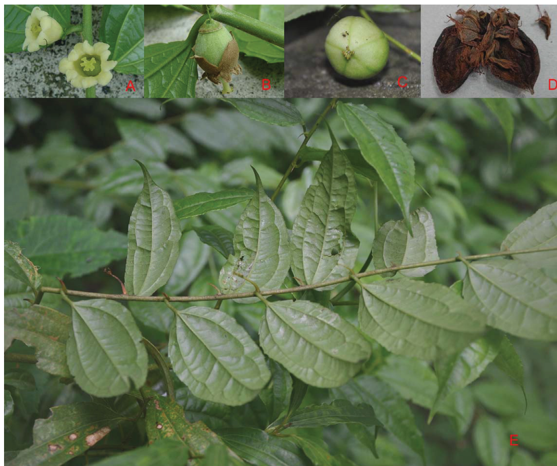
FIGURE 1: Flacourtia turbinata . (A) flowers, (B) young fruit, (C) ripe fruit, (D) longitudinal section of the fruit and one seed at the top-right corner, (E) lower side of branch showing the tortuous thorns.

rarely oblong-lanceolate or obovate-lanceolate, 8–15 × 4–6 cm, acute or rounded at base, margin serrate, long-caudate-acuminate at apex, glabrous abaxially, pubescent abaxially when young, then turning glabrous when fruiting; venation triplinerved, slightly raised on both surfaces, secondary veins conspicuous on both surfaces. Inflorescences axillary, solitary, peduncles 1–2 cm long, puberulous; bracts linear, ca. 1 × 5 mm, outside glabrous or sparsely hairy, inside pubescent, margin entire, ciliate. Flowers appearing with young leaves, white to flavescent, honey-scented. Sepals 8 or 10, coalescent as a tube, dropped together, ca. 1 cm long and 1 cm in diameter, apex obtuse, outside pubescent. Staminate flowers unknown. Pistillate flowers: ovary cone-shaped, 4 × 3 mm; styles 4–6, united into a distinct column, ca. 2 mm long, slightly free at their apices; stigmas 2-lobed, dilated, recurved. Fruit green, turbinate, 2–2.5 cm in diameter, characteristically longitudinally angled especially when dried, style column persistent. Seeds 14–16, spindly.