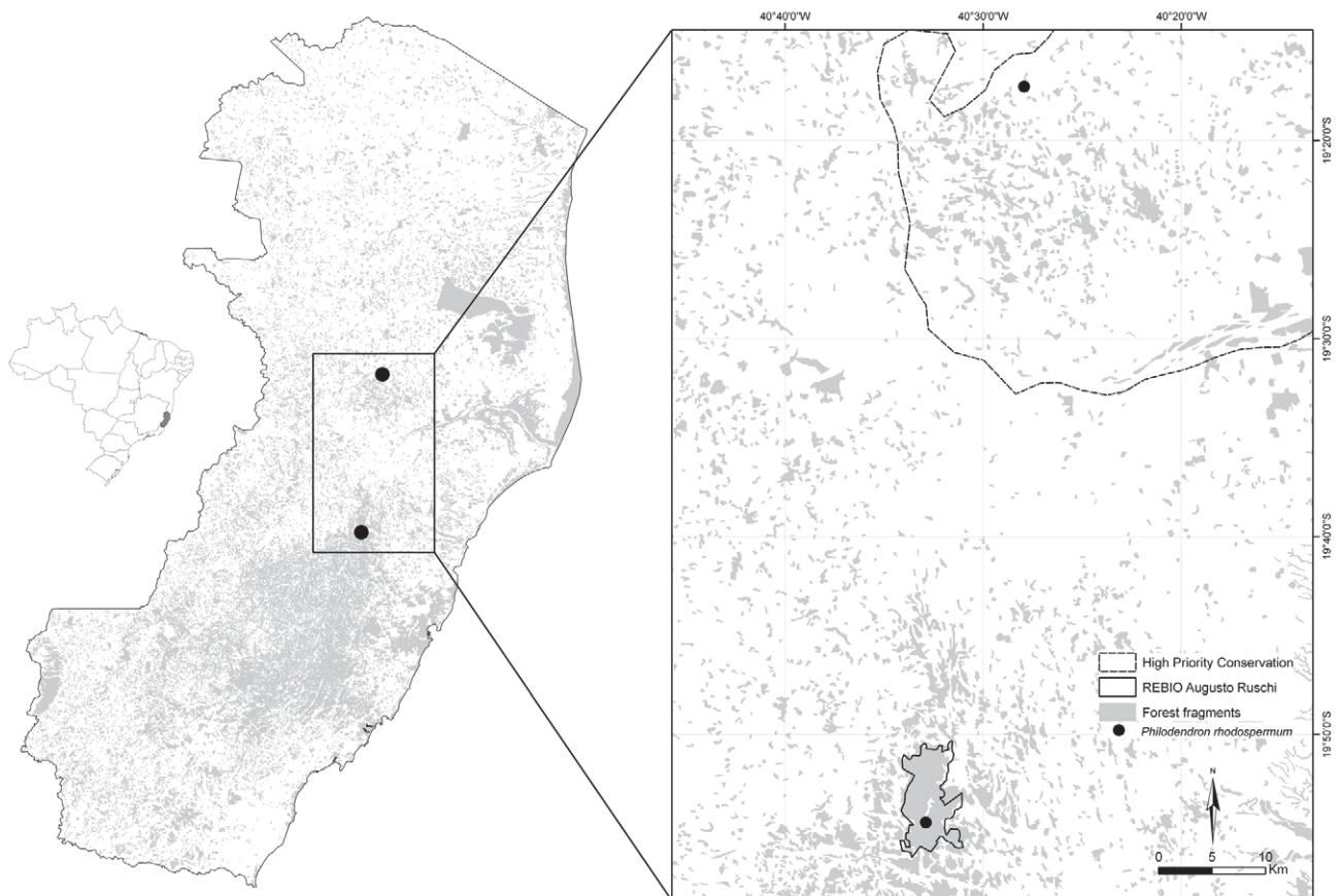
FIGURE 3. Distribution of Philodendron rhodospermum . The Northern point is situated in municipality of Governador Lindenberg and the Southern point in municipality of Santa Teresa. Delimitation of high priority conservation area according to Portaria MMA No. 09, 23 January 2007.