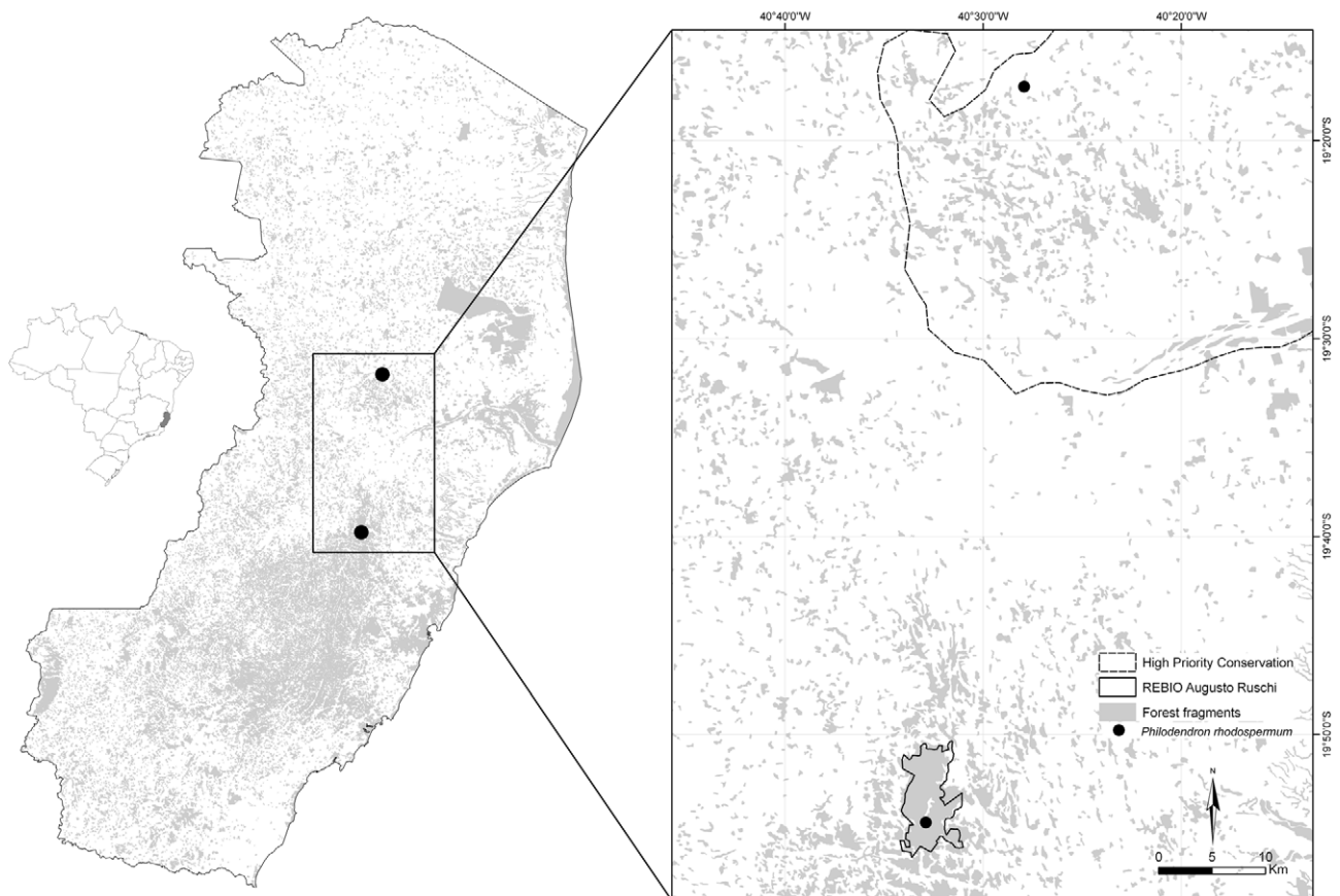
FIGURE 3. Distribution of Philodendron rhodospermum . The Northern point is situated in municipality of Governador Lindenberg and the Southern point in municipality of Santa Teresa. Delimitation of high priority conservation area according to Portaria MMA No. 09, 23 January 2007.