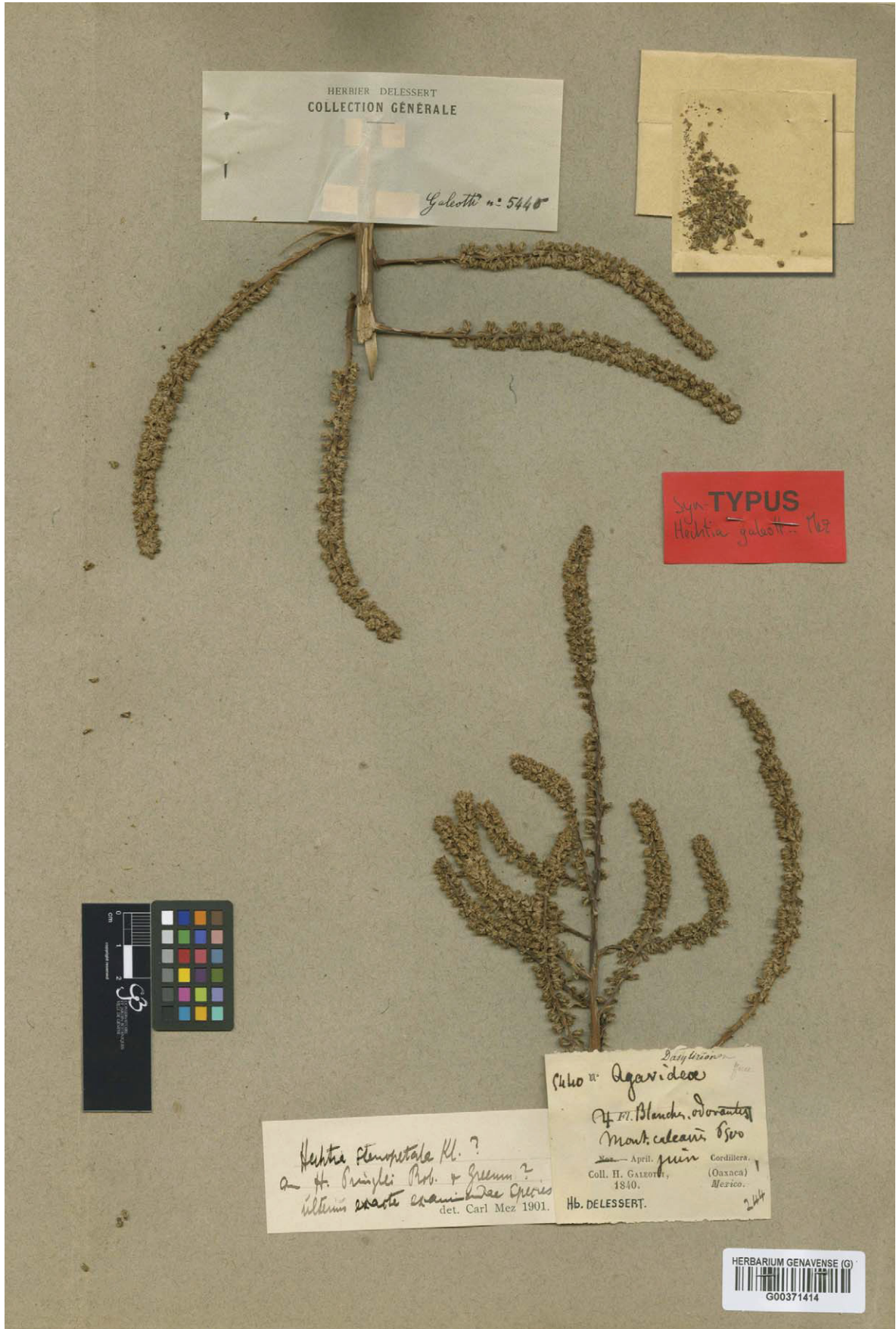
FIGURE 2. Galeotti's 5440 specimen at G.