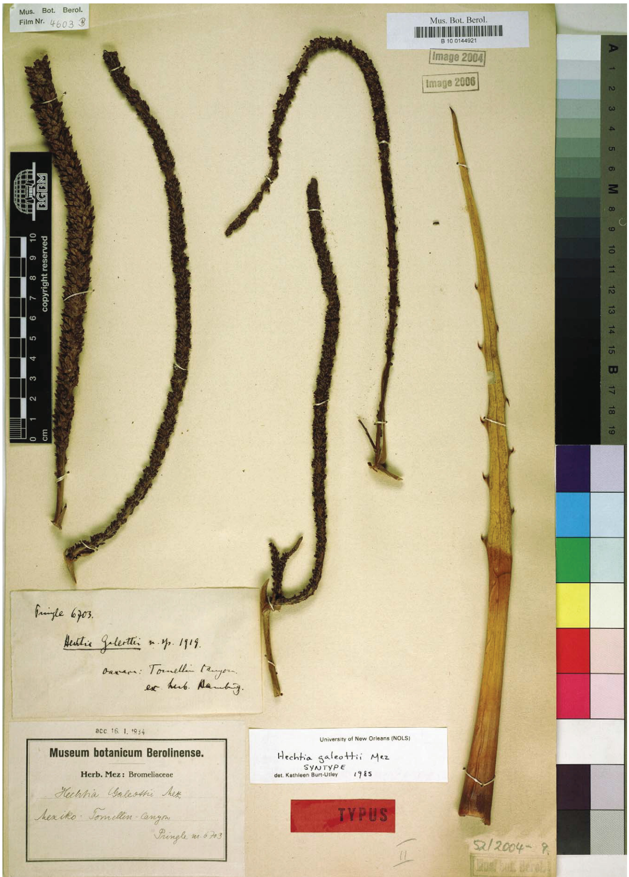
FIGURE 3. Pringle's 6703 specimen at B.