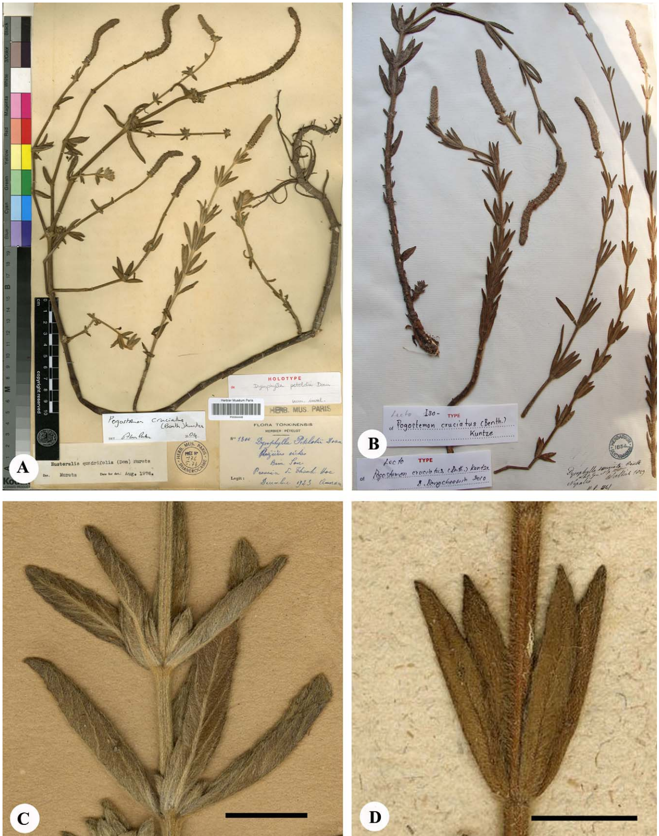
FIGURE 1. A. Holotype of Pogostemon petelotii (Pételot 1300, P); B. Isotype of P. cruciatus (Wallich 1541, K); C. Leaves of P. petelotii (Pételot 1300, P); D. Leaves of P. cruciatus (Wallich 1541, K). Scale bars: C, D = 1 cm. A and C reproduced with permission by the Muséum National d'Histoire Naturelle (MNHN), Paris; B and D with permission by Herbarium of the Royal Botanic Gardens, Kew (K)