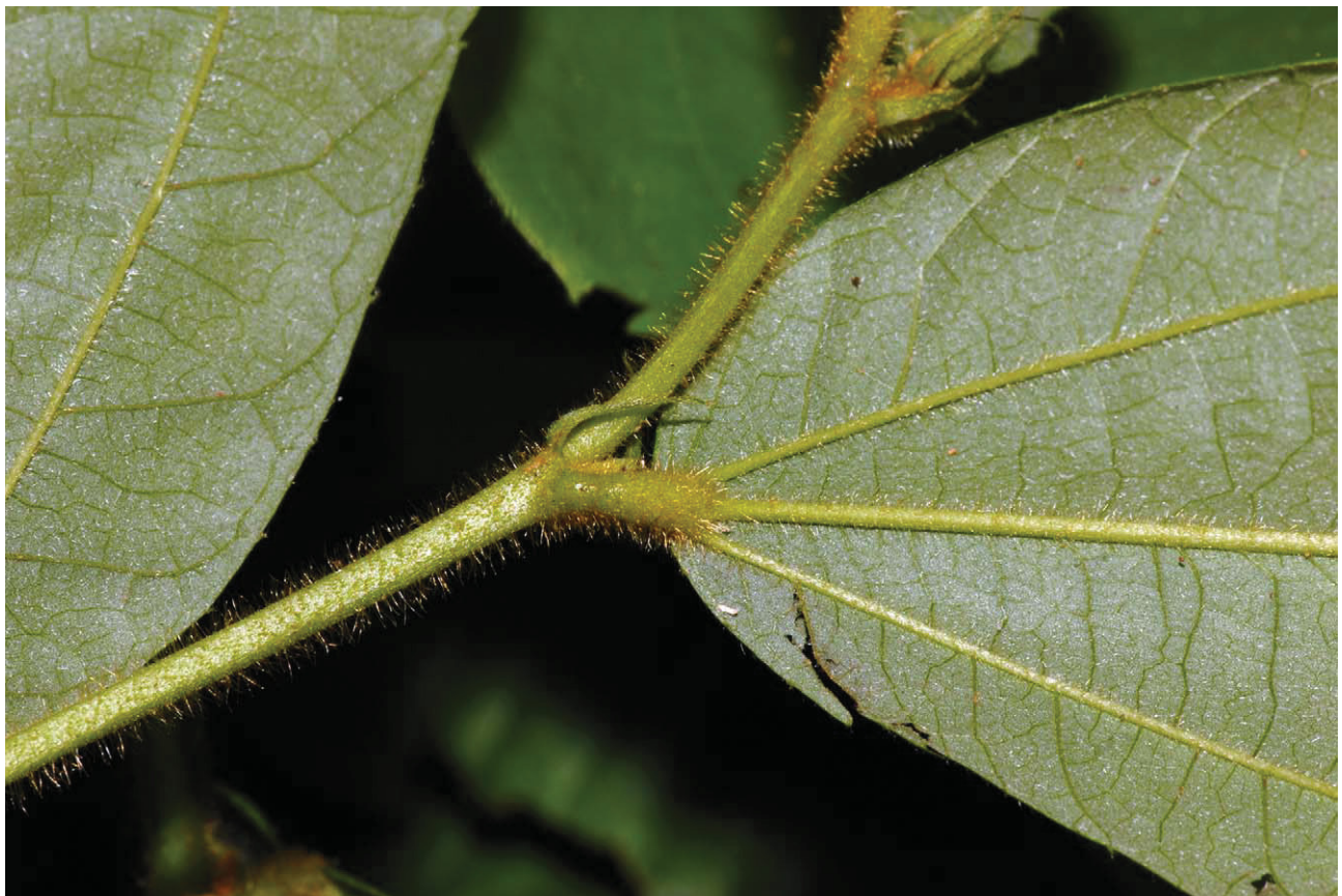
FIGURE 1. Duboscia macrocarpa . The short, stout petiole and long, straight hairs on the petiole and stem can be clearly seen.