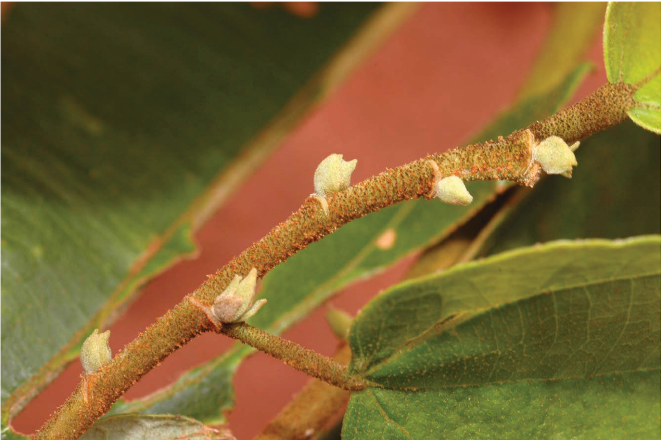
FIGURE 3. Duboscia viridiflora , with longer petiole and short, stellate hairs on the petiole.