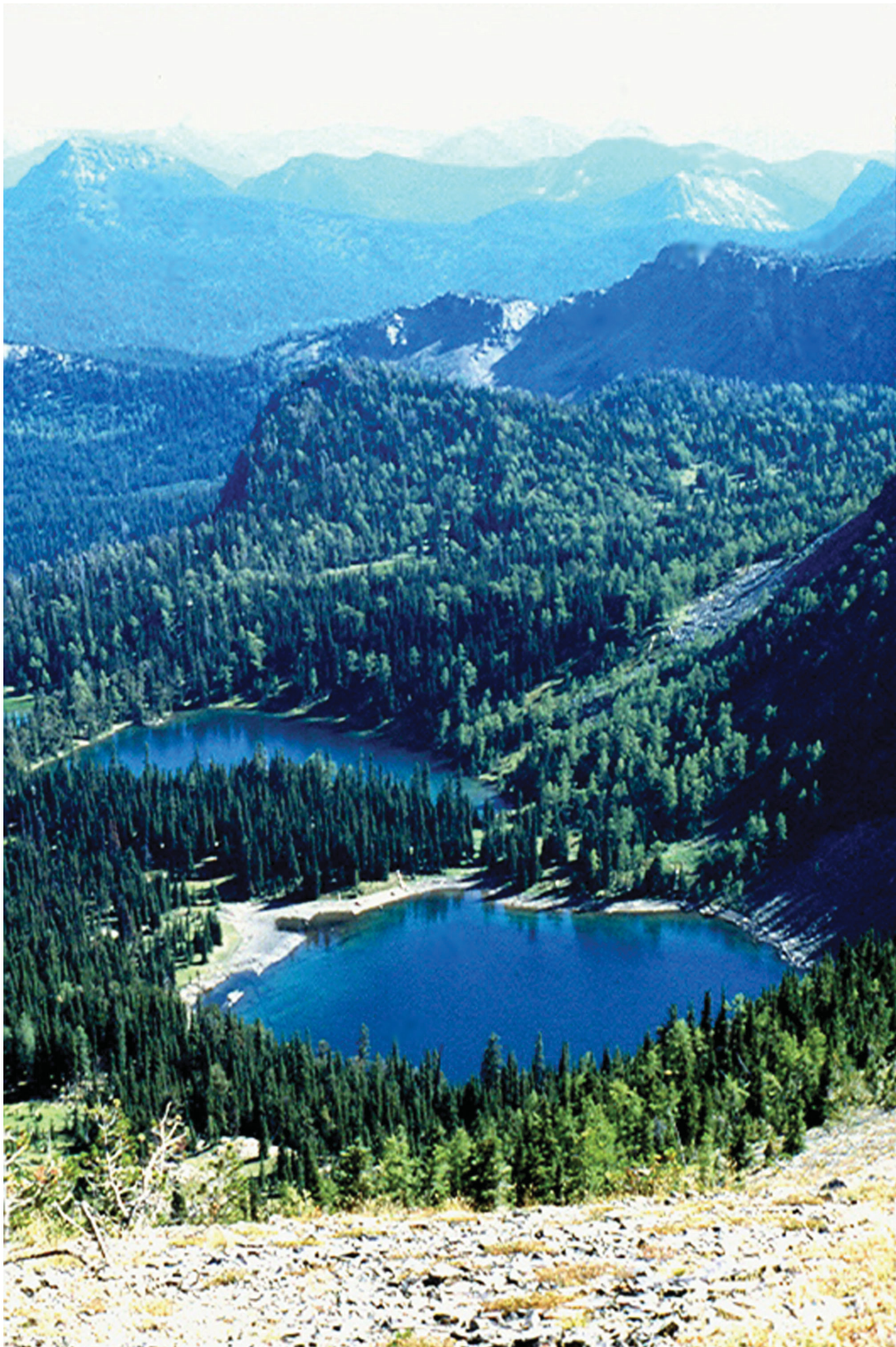
FIGURE 25: Wolverine Lakes in the Galton Range, northwest Montana. Upper Wolverine Lake (foreground) is the type locality of Stauroneis thompsonii and typical of habitats for Stauroneis species in the northern Rocky Mountains.

Observations: — Stauroneis thompsonii was reported by Bahls (2010: 61) as S. aff. catharinae Van de Vijver & Lange-Bertalot (2004: 27). However, it has significantly wider valves and lower stria and areola densities than S. catharinae . It is known only from the type locality, a small lake in the Galton Range in northwest Montana (Fig. 25).