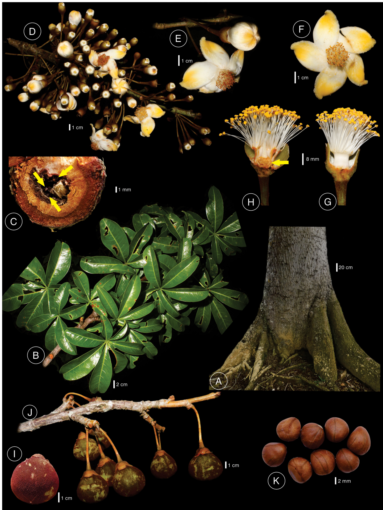
FIGURE 1. Morphological and ecological aspects of Eriotheca dolichopoda . A: Plank buttresses and furrowed bark. B: Vegetative branch with 5–7-foliolate nitid leaves. C: Hollow branch with ants (arrows). D: Leafless branch with umbelliform cymes. E: Flower bud obovate and reflexed petals. F: Unilaterally apiculate petals. G: Dissected flower showing cupuliform calyx and staminal tube. H: Dissected flower showing ovary indument (arrow). I: Young fruit exocarp with pulverulent, ferruginous indument. J: Leafless branch with pendent, long pedicellate, subglobose to obovoid fruits (note the absence of glands on receptacles). K: Numerous, striate seeds.