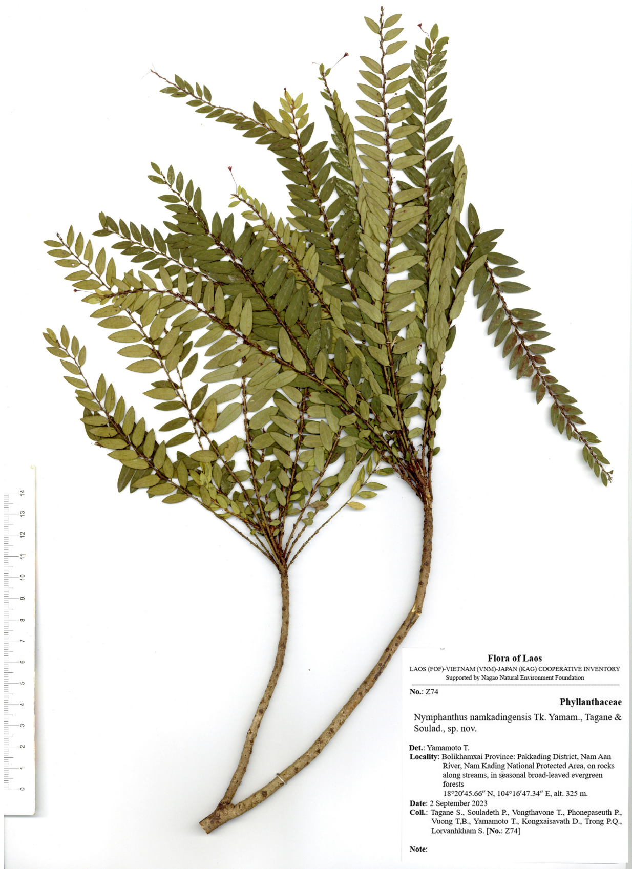
FIGURE 1. Holotype of Nymphanthus namkadingensis Tk.Yamam., Tagane & Soulad. ( Tagane et al. Z74, FOF).

(staminate flowers 4–8 mm long and pistillate flowers 10–16 mm long vs. ca. 1.5 mm and ca. 2.5 mm, respectively), and connate and annular disc glands of pistillate flowers (vs. free, in the form of rectangular tongues) (Table 1).