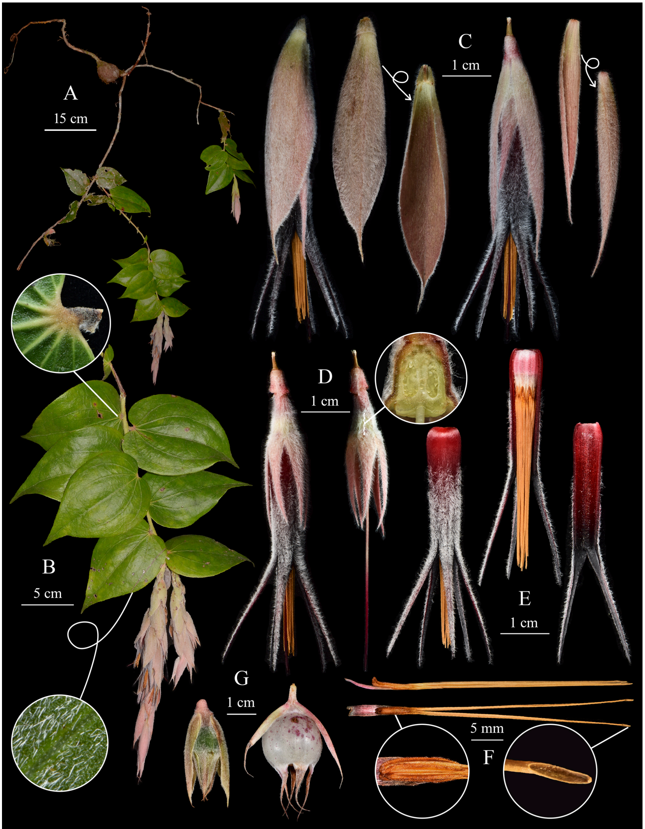
FIGURE 1. Lankester composite digital plate (LCDP) of Ceratostema agettiorum . A. Habit. B. Terminal branch and inflorescence with close-up of the basal nerves of the adaxial side and trichomes of the abaxial side of the leaf. C. Flower with floral bracts and bracteoles in adaxial and abaxial views. D. Flower without floral bracts and a close-up of the longitudinal section of the calyx and ovary. E. The entire corolla and its longitudinal section. F. Stamens with a close-up of the thecae and pores of the tubule. G. Immature (left) and mature (right) fruit. Elaborated by Henry X. Garzón-Suárez based on photographs of the type.