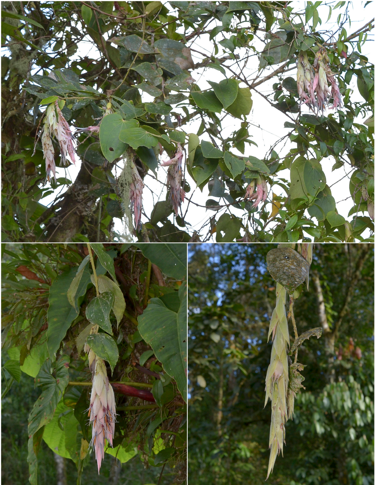
FIGURE 4. Ceratostema agettiorum in situ.

influence from the Amazonian flora and most of the trees belong to taxa of Andean origin (Baéz et al. 2013). According to Luteyn (1996), C. megabracteatum is distributed around Cosanga at higher altitudes from 1850 to 2240 m in cloud forests of the province of Napo, northeastern Ecuador (Fig. 5). Santiana et al. (2013a: 112, 2013b: 114), mentioned that the type of forest of this area is classified as evergreen montane and lower montane forest in the northern part of the Eastern Cordillera (BsMN01 & BsBN01).