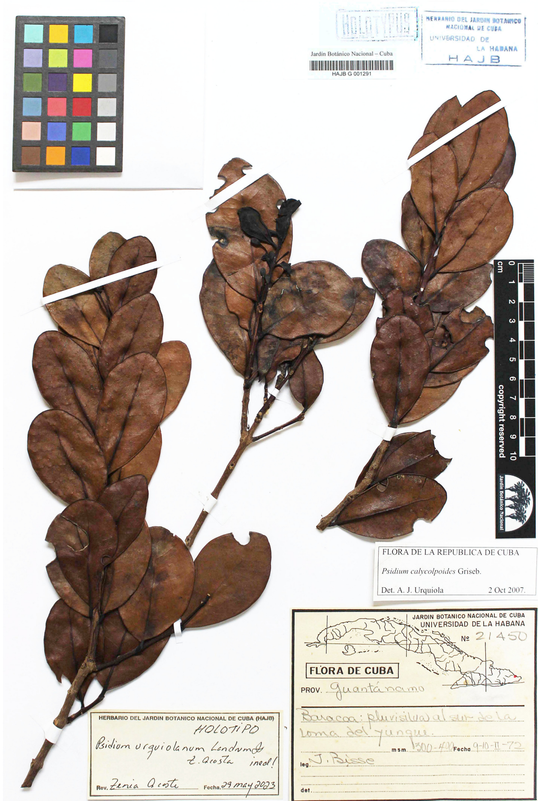
FIGURE 3. Image of holotype specimen at HAJB.