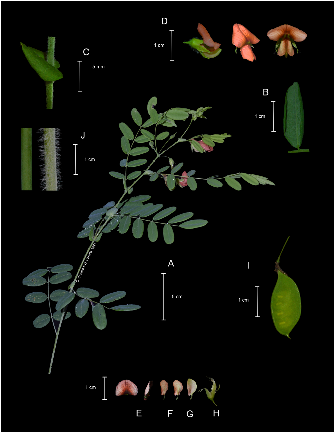
FIGURE 3. Brongniartia variabilis. A. Branch with flowers, B. Foliole, C. Stipule, D. Flowers, E. Standard (front and lateral view), F. Wings petals, G. Keel petals, H. Calyx and androecium, I. Fruit, J. Indument of the stem.