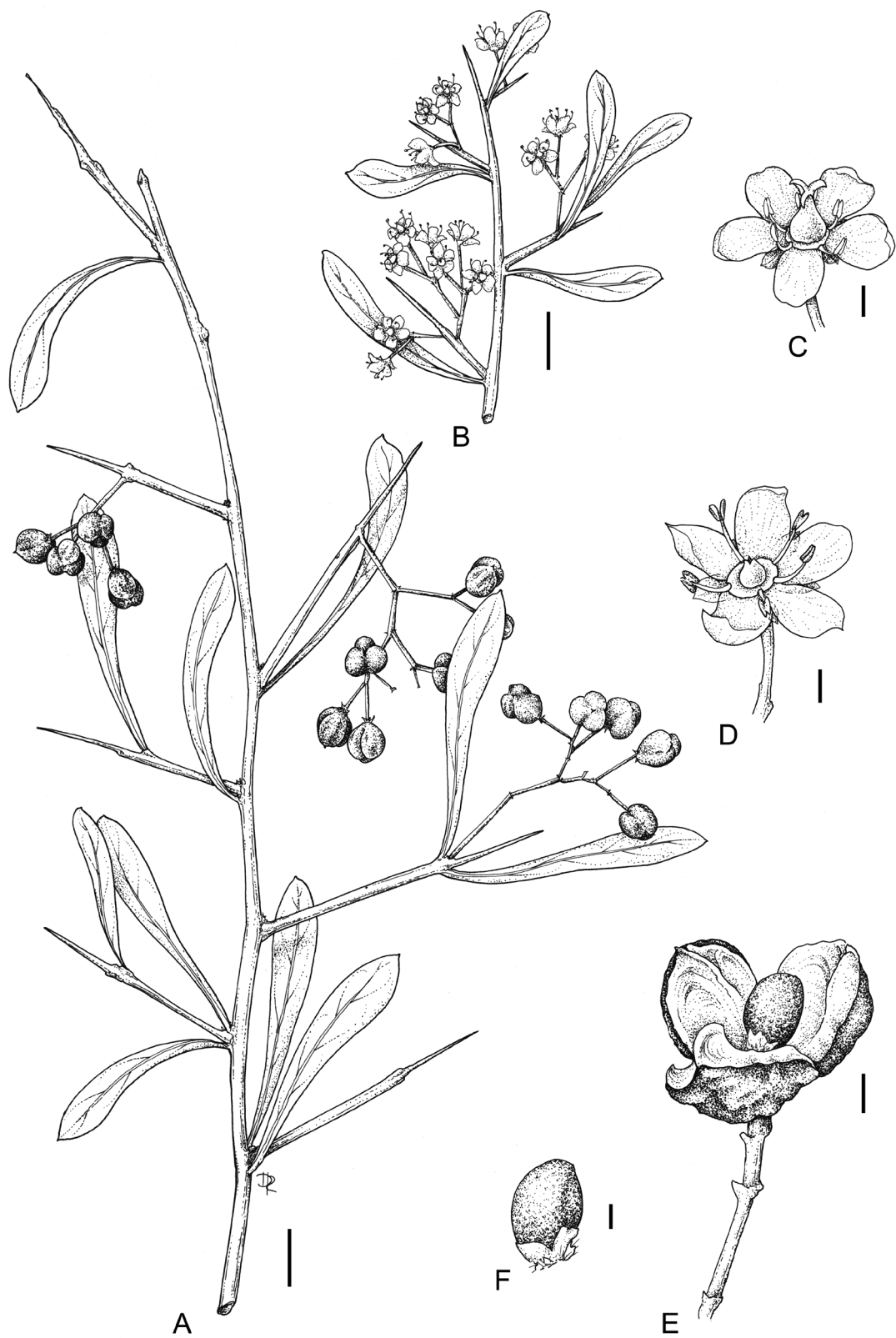
FIGURE 2. Gymnosporia sekhukhuniensis . A. Leafy branchlet with fruit. B. Twig with male flowers. C. Female flower. D. Male flower. E. Dehisced capsule with seed. F. Seed, with basal aril. Scale bar = 10 mm (A & B), 1 mm (C, D & F) and 2 mm (E). A from Winter 2585 , B from Winter 2932 , C from Schmidt 845 , D from Stalmans 695 , E & F from McMurtry 12408 . Artist: Daleen Roodt.