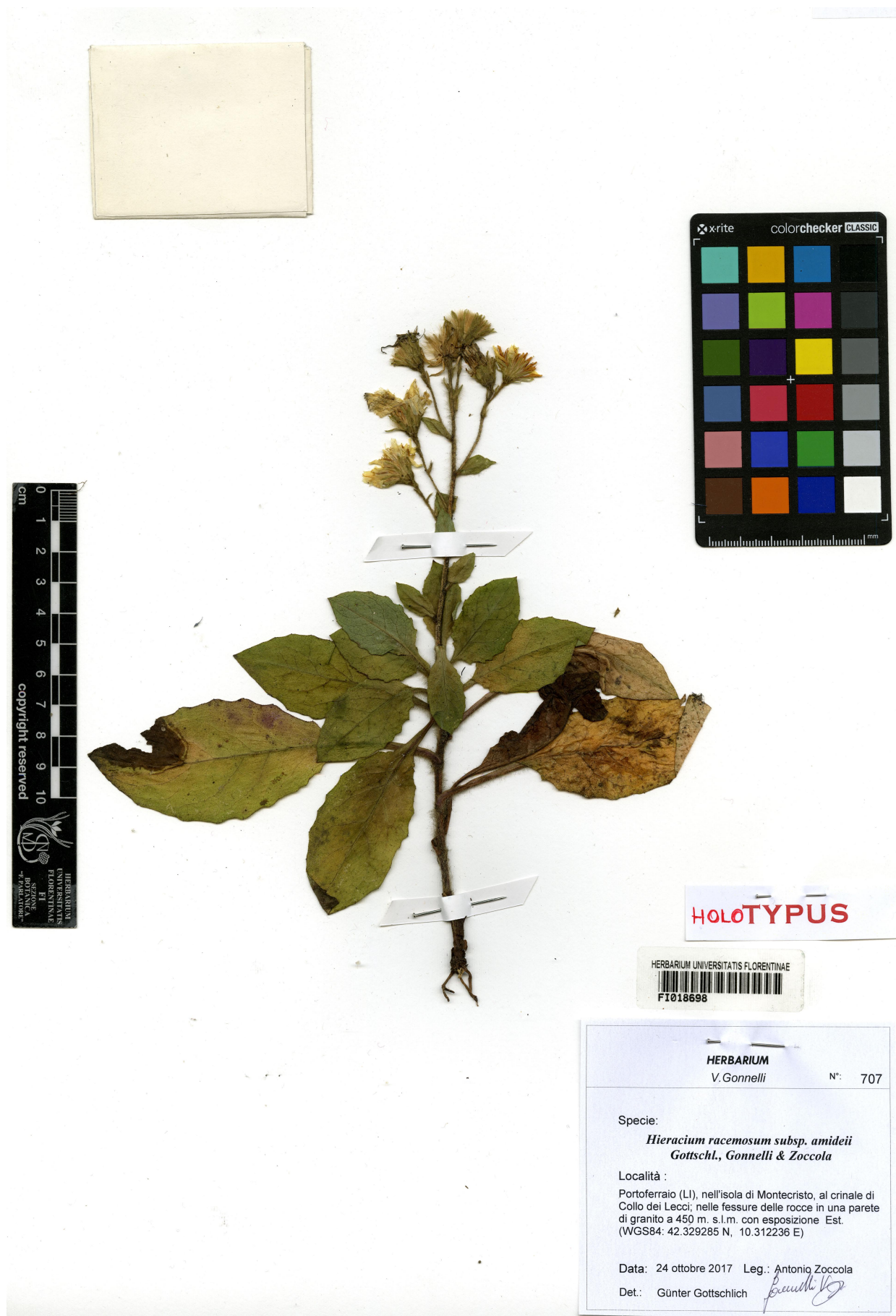
FIGURE 1. Holotype of Hieracium racemosum subsp. amideii preserved in the Herbarium of Natural History Museum, Florence University (FI 018698).