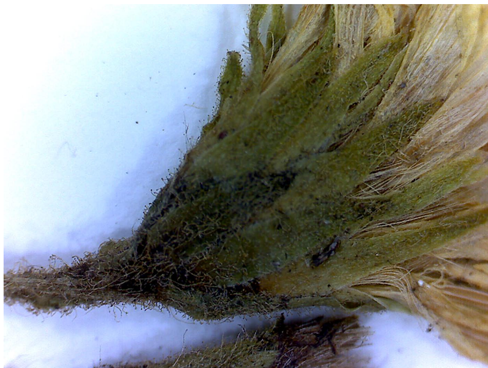
FIGURE 2. Hieracium racemosum subsp. amideii : involucre (taken from the isotype, Gottschlich 71448).

Distribution and ecology: —Endemic to the Insula Montecristo, Hieracium racemosum subsp. amideii grows in cracks of granite rocks in the short mountain range that crosses the island of Montecristo, from the top of the Fortezza (645 m) to the top of Collo Fondo (621 m) up to Punta dei Lecci (563 m) in various expositions to a quota between 350 and 600 m s.m. approximately.