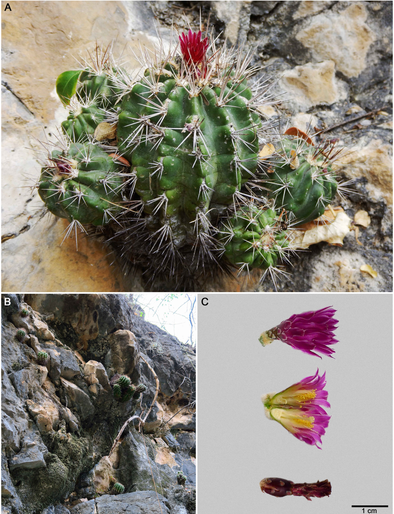
FIGURE 2. Thelocactus tepelmensis (body, flower, and fruit) and its habitat. A. Caespitose individual with several lateral stems (Type). B. Vertical limestone wall with several individuals. C. External aspect of a flower (above); dissected flower showing the internal perianth segments, the stamens, and the gynoecium (middle); and, semi-mature fruit with persistent perianth (below). Voucher: H.M. Hernández et al. 4128 (MEXU).