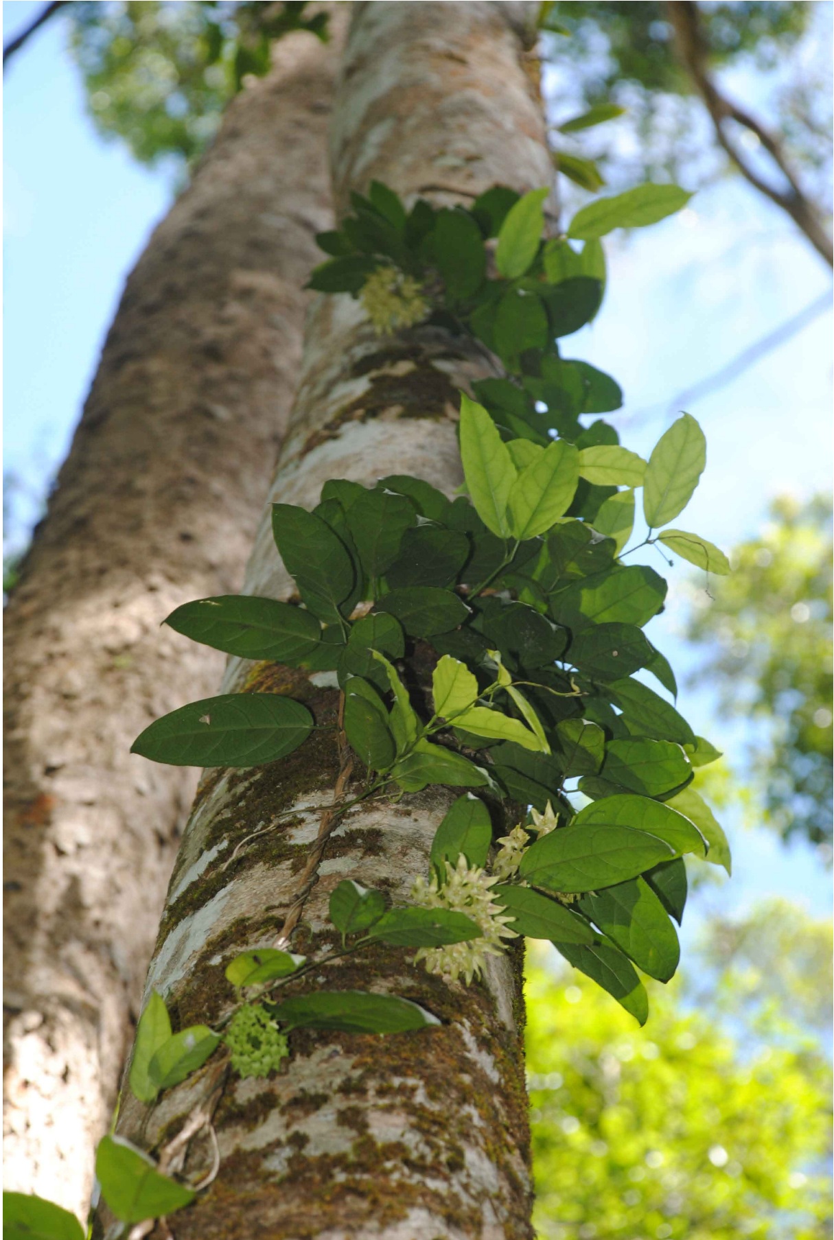
FIGURE 1. Dregea taynguyenensis . Flowering branch in the habitat of the type locality.