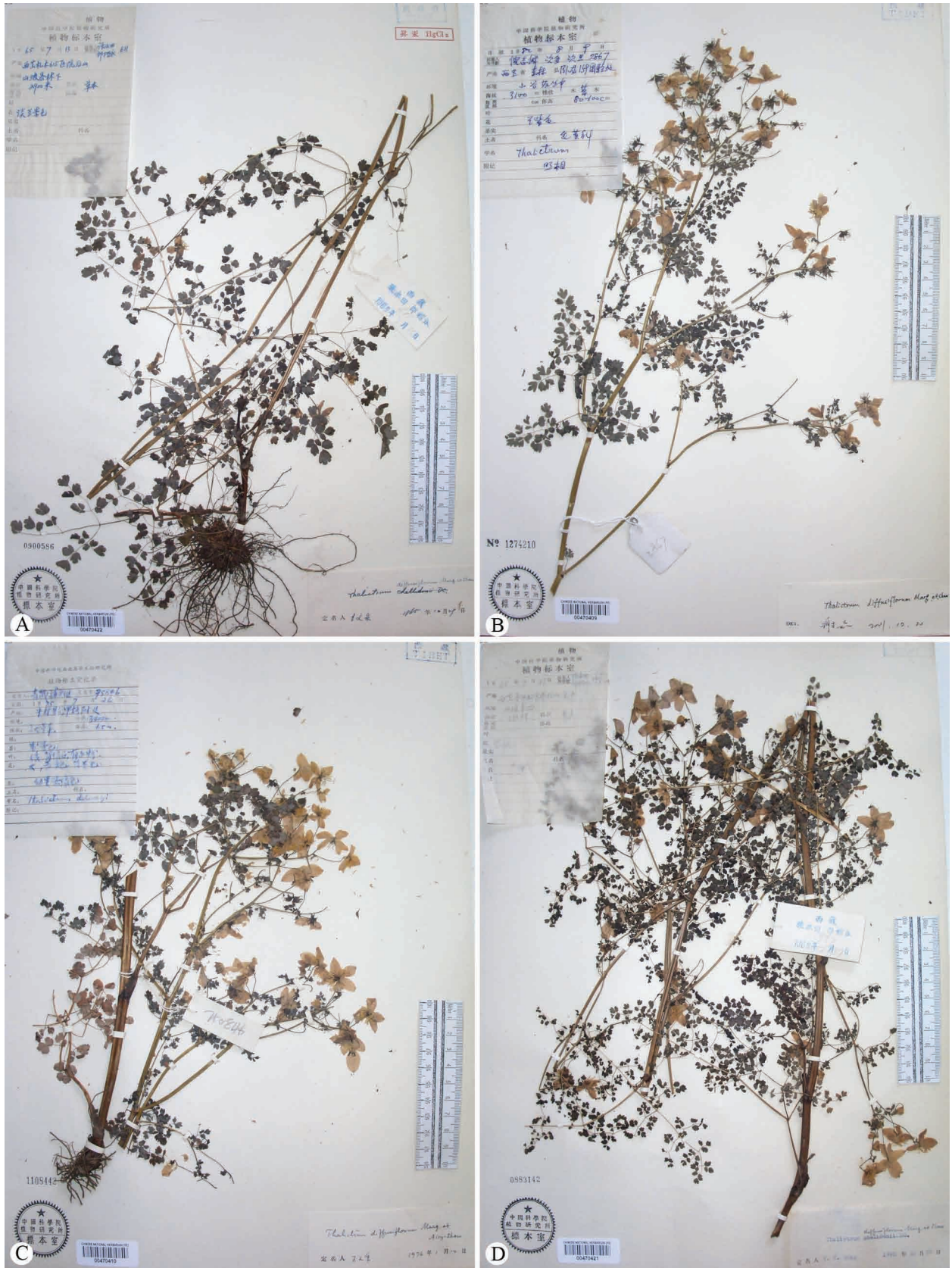
FIGURE 3. Specimens of Thalicttrum diffusiflorum . A. China, south-east Xizang, Bomi, Zamu, Y.T. Chang & K.Y. Lang 611 (PE). B. China, south-east Xizang, Mainling, Wolong, C.C. Ni et al. 2867 (PE). C. China, south-east Xizang, Mainling, Jiage, C.C. Ni et al. 2867 (PE). C. China, south-east Xizang, Nyingchi, Lulang, Y. T. Chang & K.Y. Lang 997 (PE).