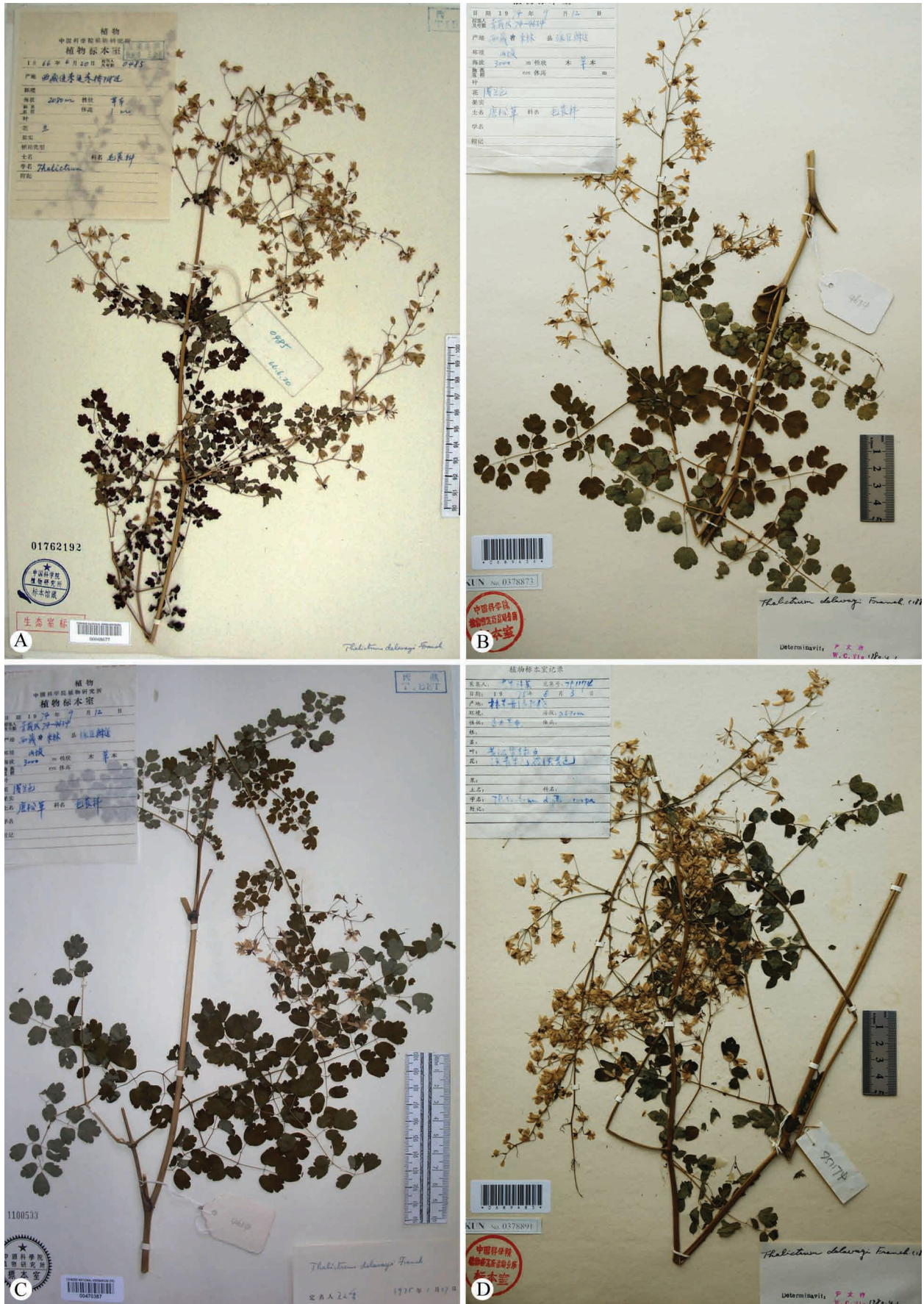
FIGURE 4. Specimens of Thalictrum delavayi . A. China, south-east Xizang, Bomi, Tongmai, J.W. Zhang & J.T. Wang 0485 (PE). B. China, south-east Xizang, Mainling, Paiqu, Qinghai-Xizang Exped. 74-4634 (KUN). C. Same locality, Qinghai-Xizang Exped. 74-4634 (PE). D. China, south-east Xizang, Nyingchi, Lulang, Qinghai-Xizang Suppl. Exped. 751174 (KUN).