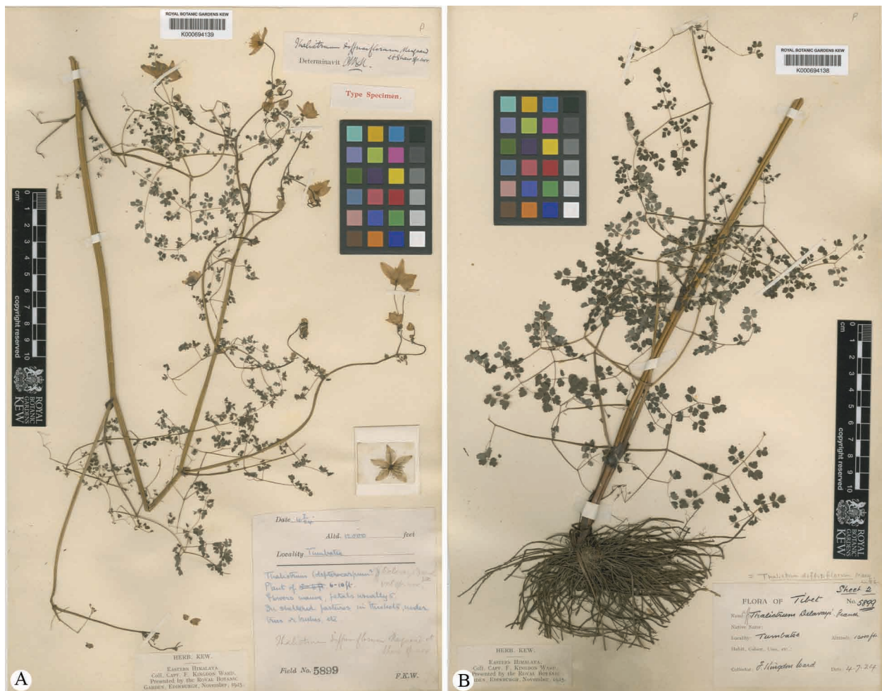
FIGURE 2. Holotype sheet (A) and isotype sheet (B) of Thalictrum diffusiflorum .

In having relatively larger flowers, Thalictrum diffusiflorum is somewhat similar to T. delavayi , a species fairly common in west Guizhou, west Sichuan, south-east Xizang, and Yunnan, China (four specimens from south-east Xizang are shown in Fig. 4 for the convenience of comparison). The former is most readily distinguishable from the latter, among other characters as given by Wang (2013) for distinguishing between T. callianthum and T. delavayi , by the stem, leaves, inflorescence axis, pedicels and carpels being all more or less glandular pubescent (vs. glabrous) and, as indicated by the specific epithet “ diffusiflorum ”, the usually quite lax (vs. relatively dense) panicle.